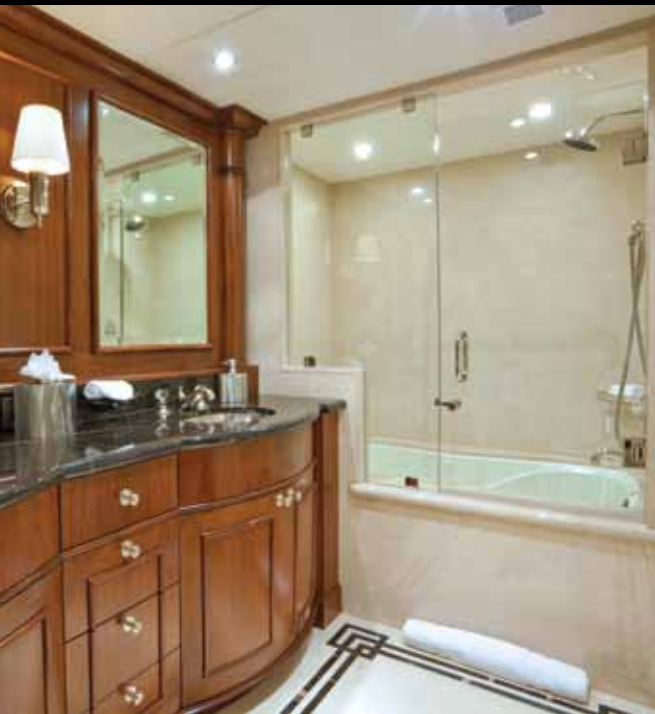
GUEST KING STATEROOM

In the Skylounge relax around the coffee table or at the sophisticated walnut and onyx bar, the perfect spot to enjoy an aperitif, a magnificent view, and recount the day's adventures.