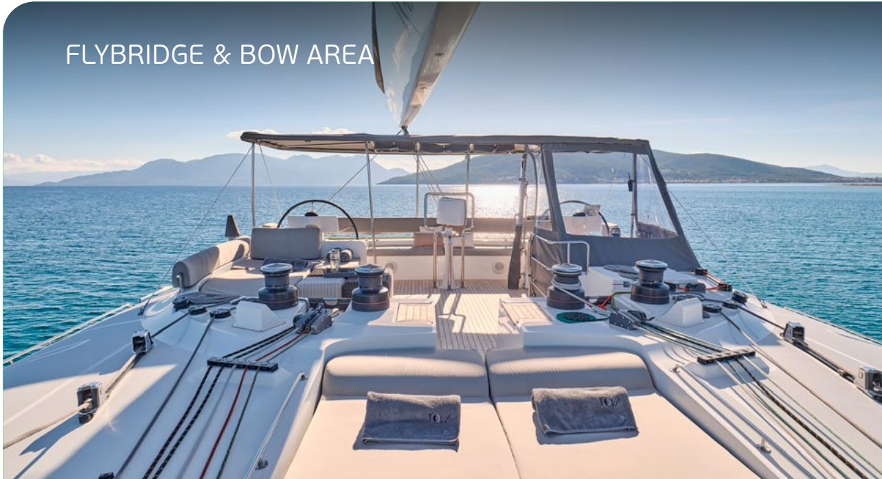
FLYBRIDGE & BOW AREA