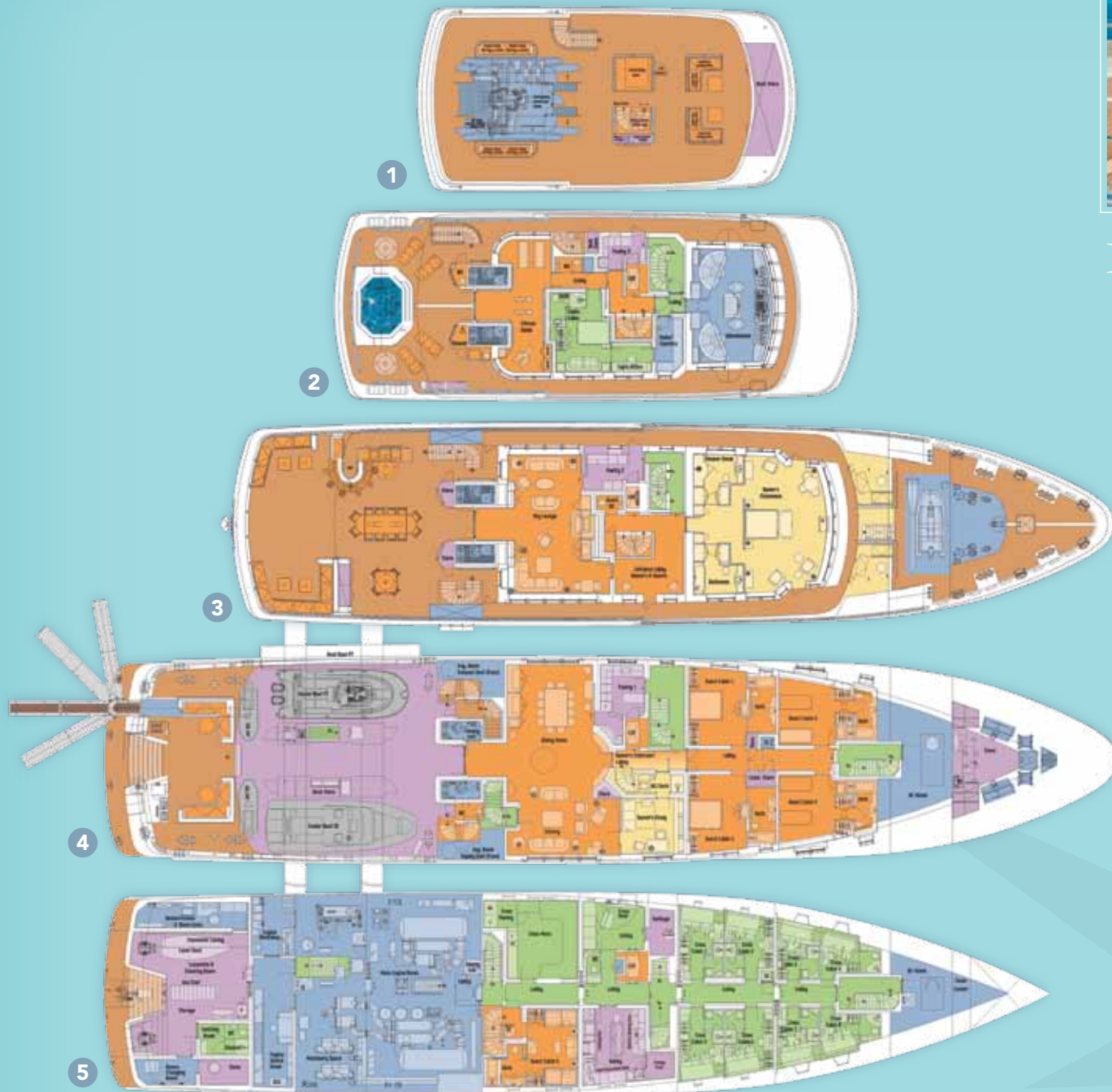
1. SUN DECK 2. BRIDGE DECK 3. OWNER'S DECK 4. MAIN DECK 5. LOWER DECK

Type / Rig: Tri-Deck Motor Yacht Builder: Lürssen Shipyard, Germany / 2005 Refit: 2011 Length: 208 feet (63.4 M) Draft: 12 feet (3.65 M) Beam: 42 feet (12.80 M) Flag: Cayman Island Speed: 13 knots cruise/15 knots max Exterior Design: Espen Øeino Interior Design: Pauline Nunn Interior Refit: Aileen Rodriguez Construction: Steel hull and aluminum superstructure Class: Lloyds +100A1, LMC MCA / ISM and ISPS Compliant Engines: 2x 3512 Caterpillar Diesels approx. 1,957-hp each (1.440kW) Fuel: 50,000 gallons (189,271 ltr) Water: 7,400 gallons (28,000 ltr) Watermakers: 2x HEM 12,000 gpd Range: Approx 7,000 nautical miles @ 12 knots Electrical: 3 x Caterpillar generators 285 kWh each, 1x Cat emergency generator - 150 kWh Bow Thruster: Brunvoll 220-hp Stern Thruster: Schottel Stabilizers: Quantum Zero EXT Crew: Captain plus 16 crew Water Activities: 29-foot Naiad tender, 29-foot Master Craft tender, 2x 1800hcc Waverunners, plus waterski toys