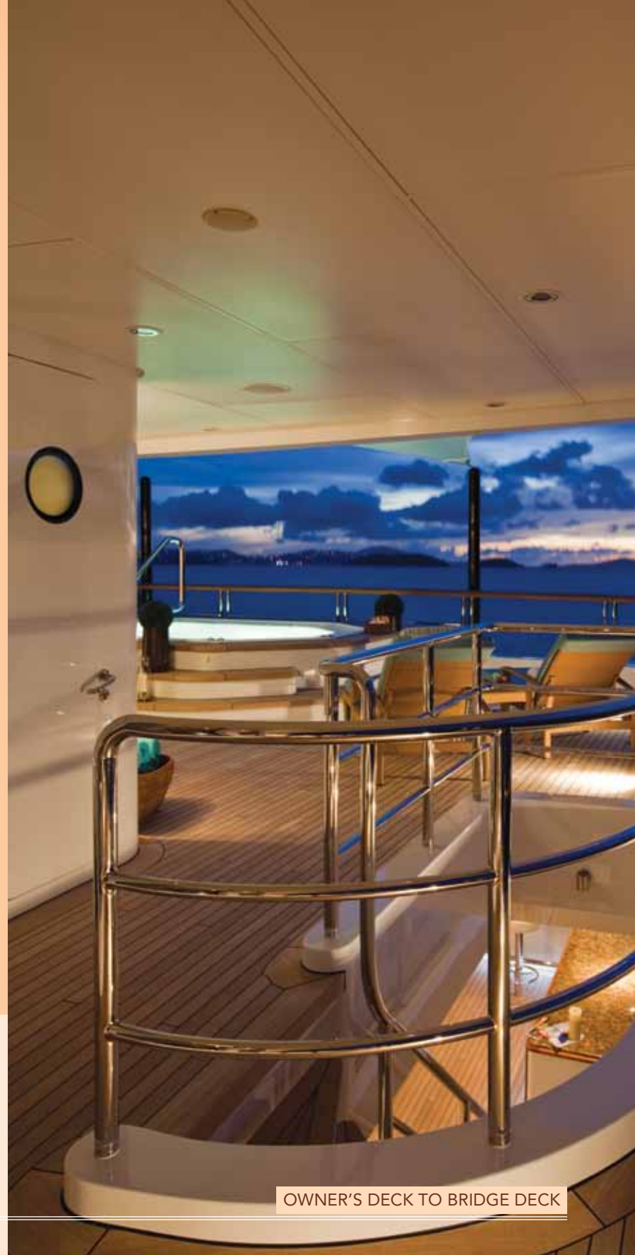
OWNER'S DECK TO BRIDGE DECK

Alfresco dining and socializing in the natural atmosphere of your cruising destinations are exquisite treats while yachting. Aft of the master quarters is a hypnotic setting to take in a sunset or enjoy an evening under the stars. A large dining table with chairs, a well-stocked wet bar with stools and many loungers set up this area for delectable cocktails and cuisine. For another treasured pastime onboard, a port stairwell leads up one deck for a soak in the outdoor Jacuzzi.