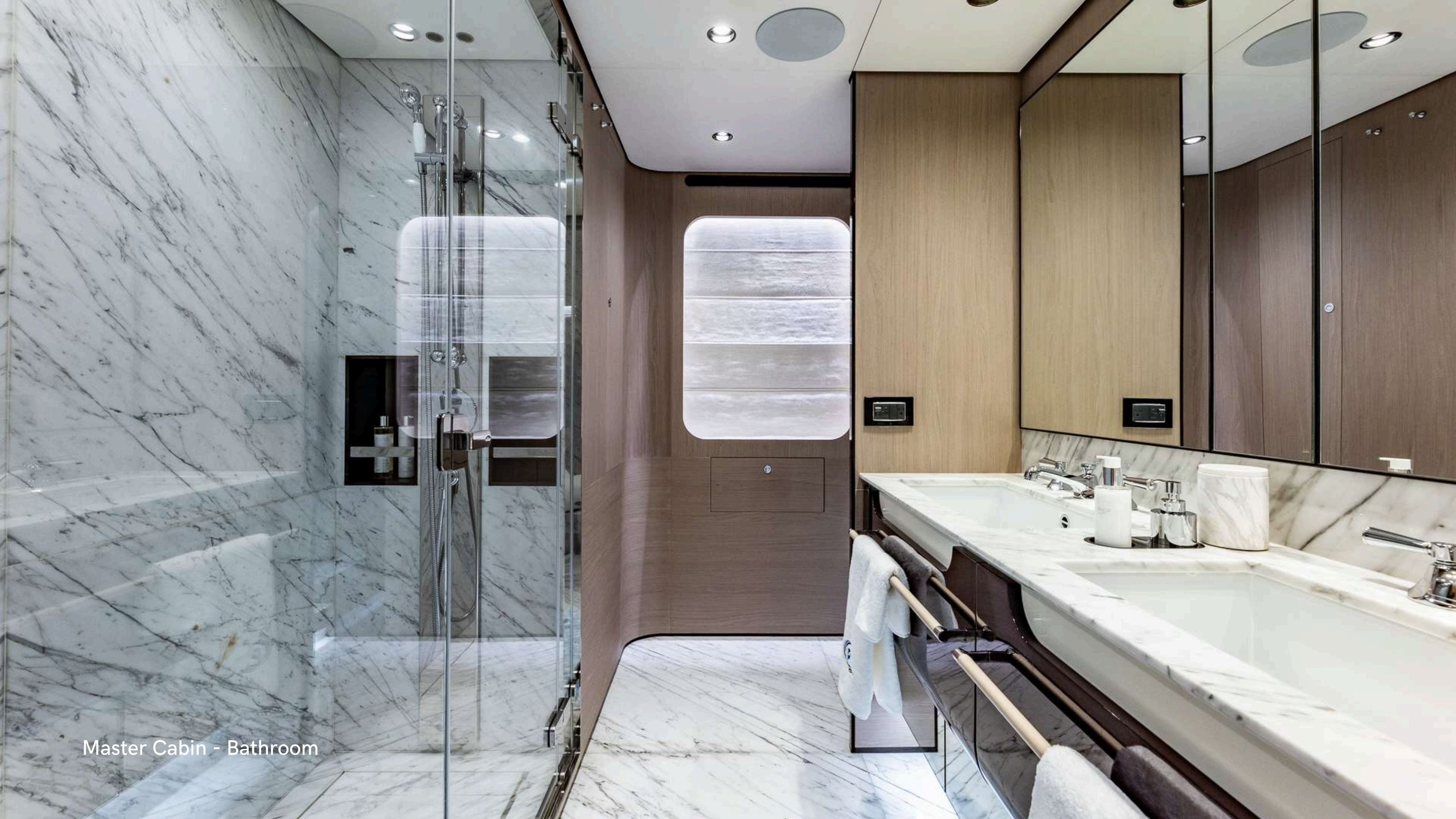
Master Cabin - Bathroom