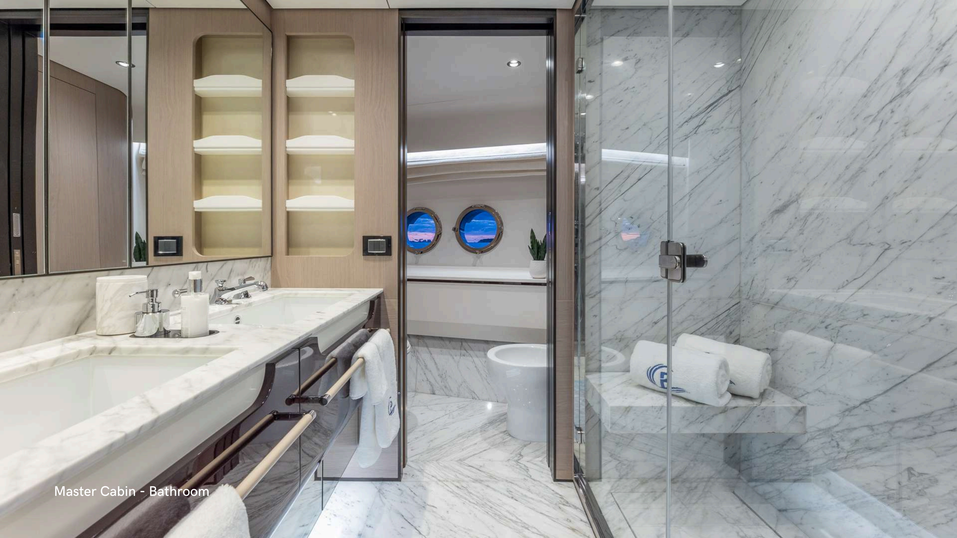
Master Cabin - Bathroom