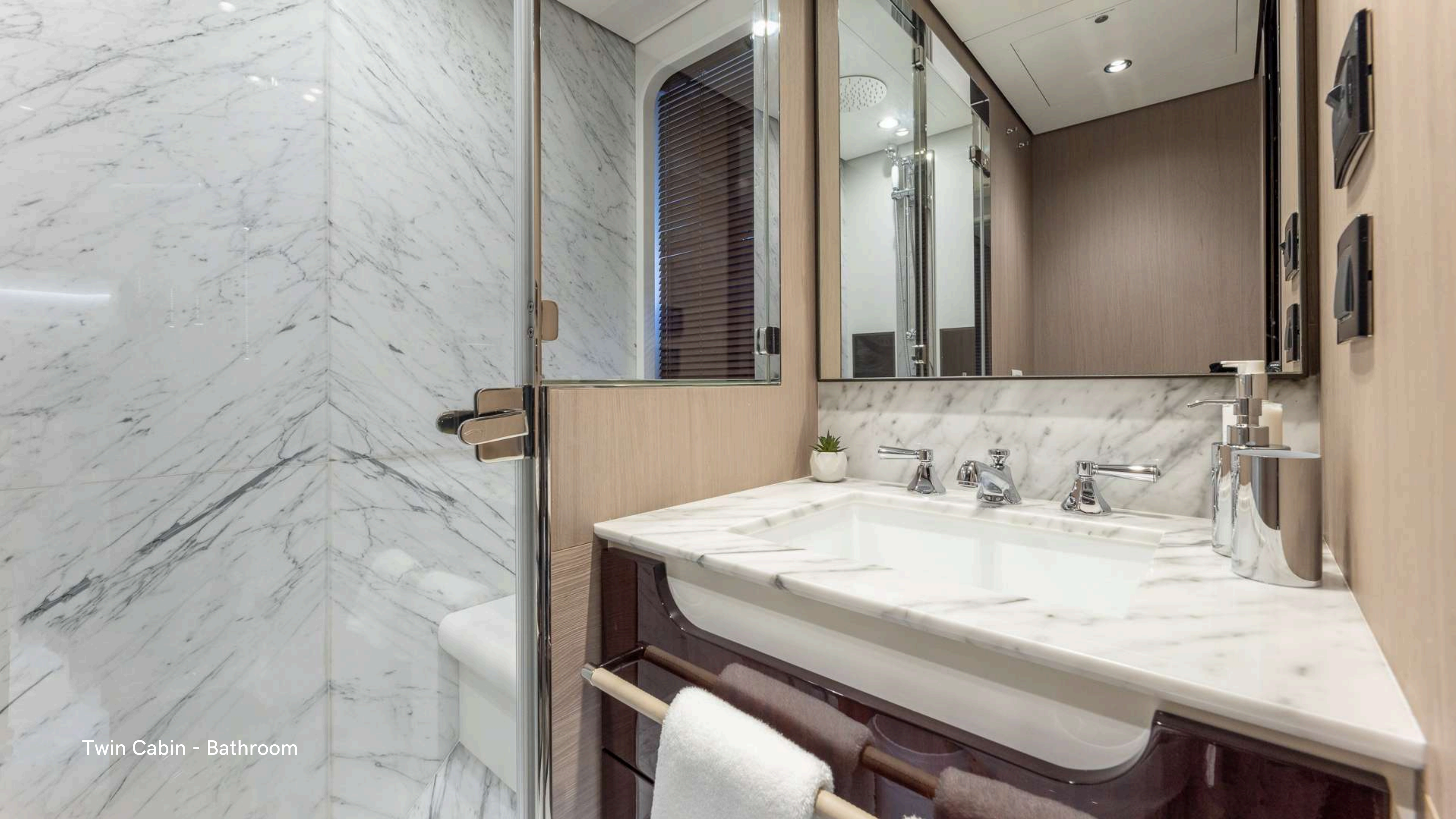
Twin Cabin - Bathroom