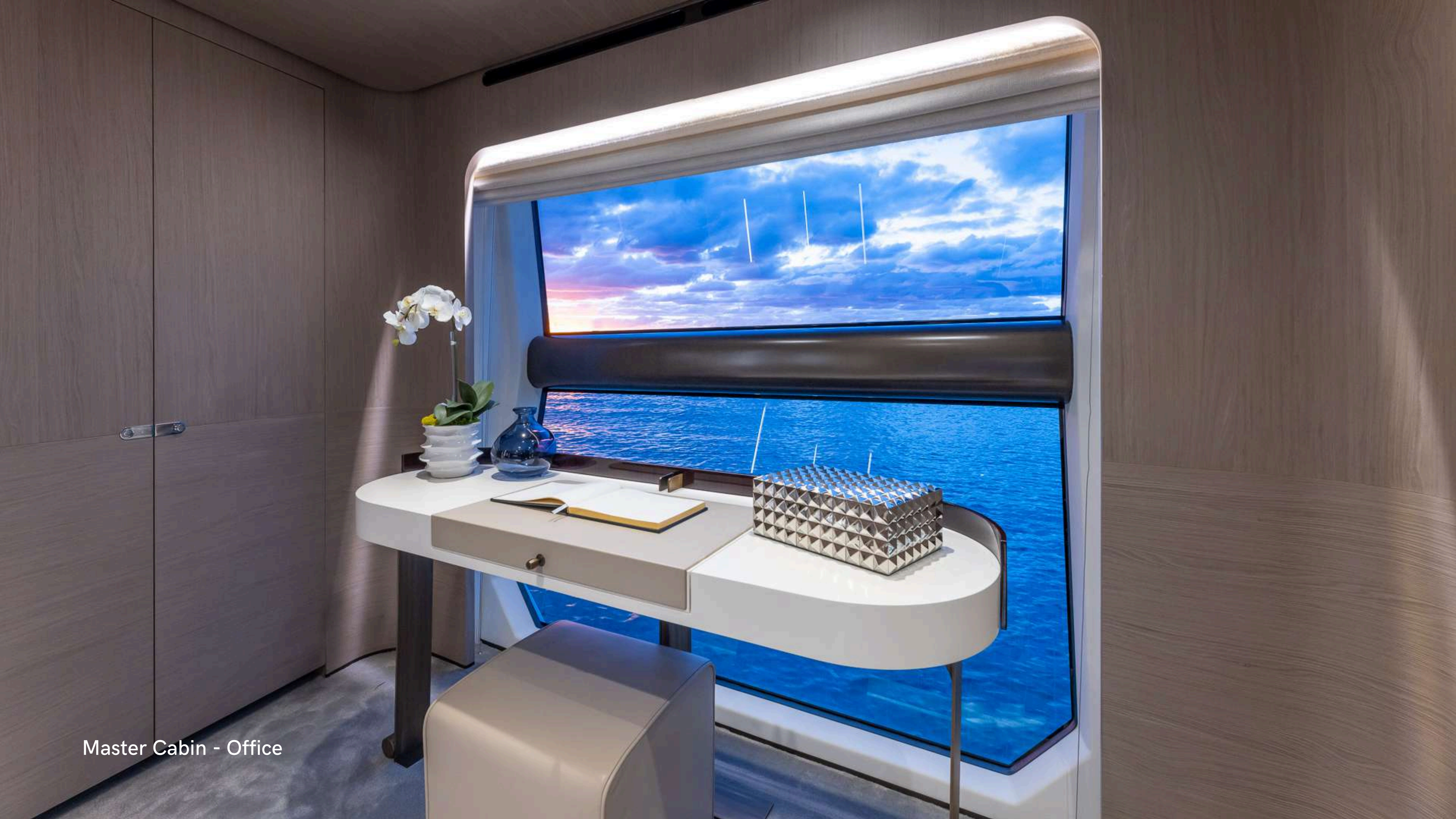
Master Cabin - Office