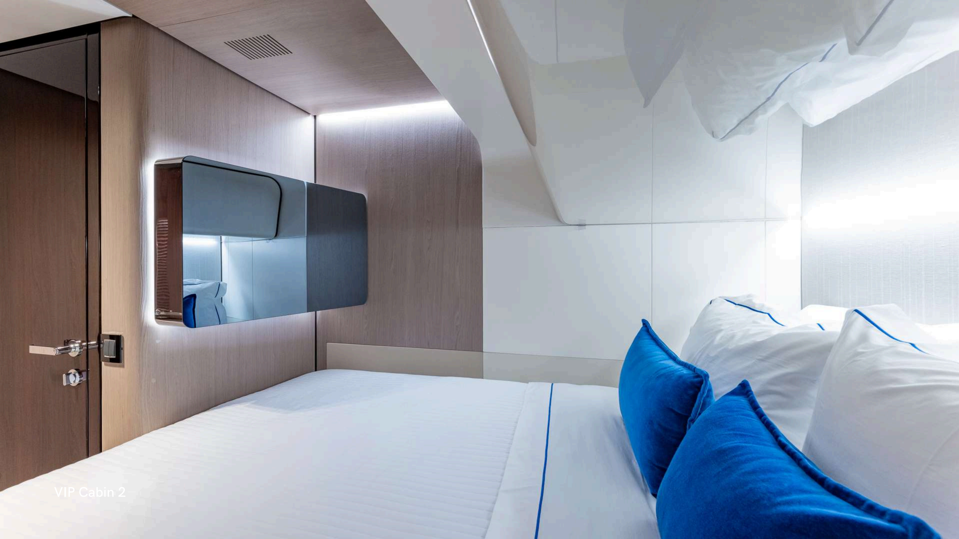
VIP Cabin 2