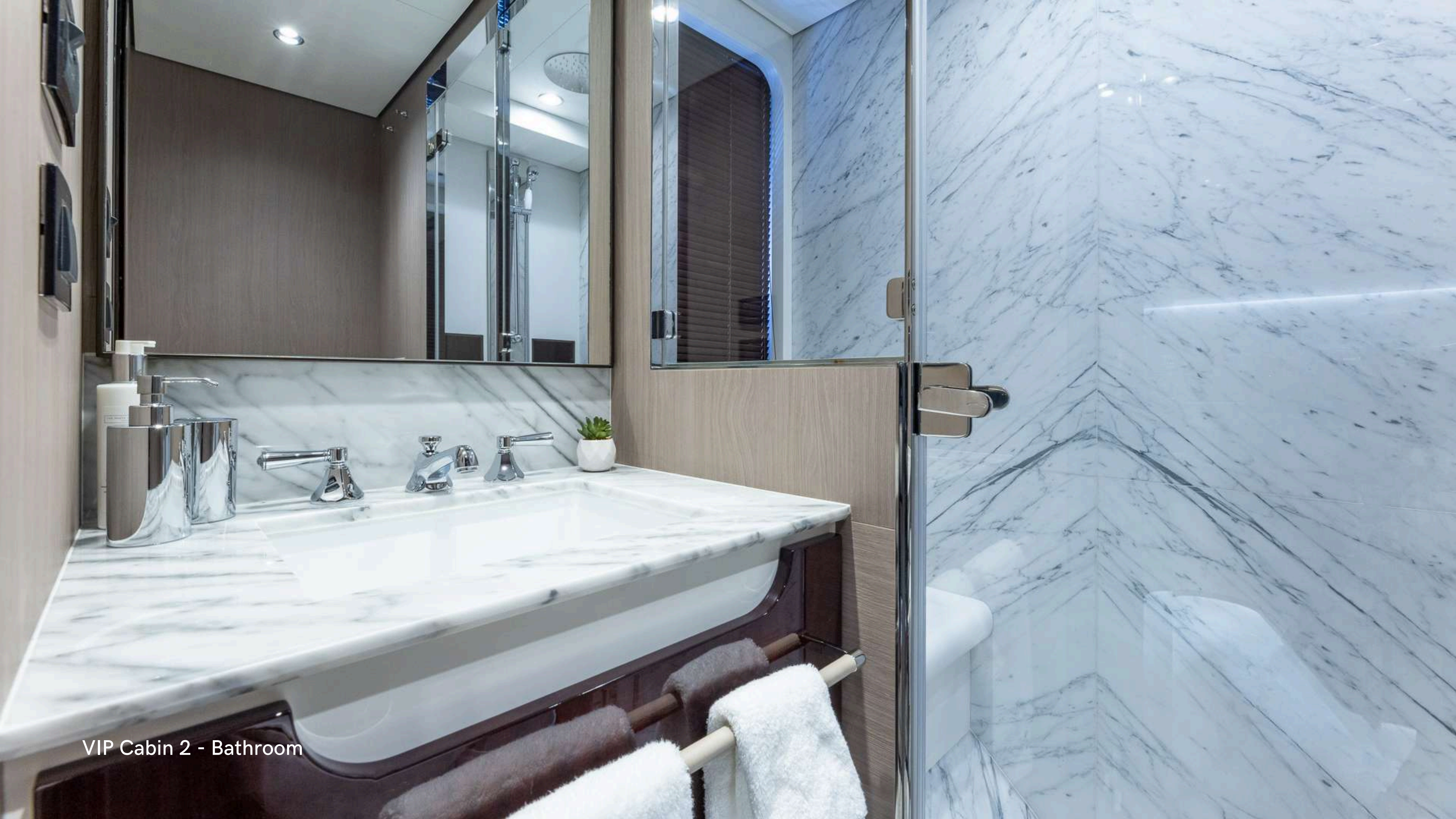
VIP Cabin 2 - Bathroom