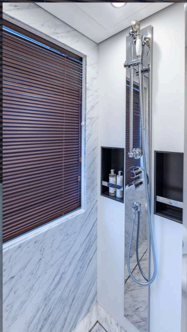
VIP Cabin - Bathroom