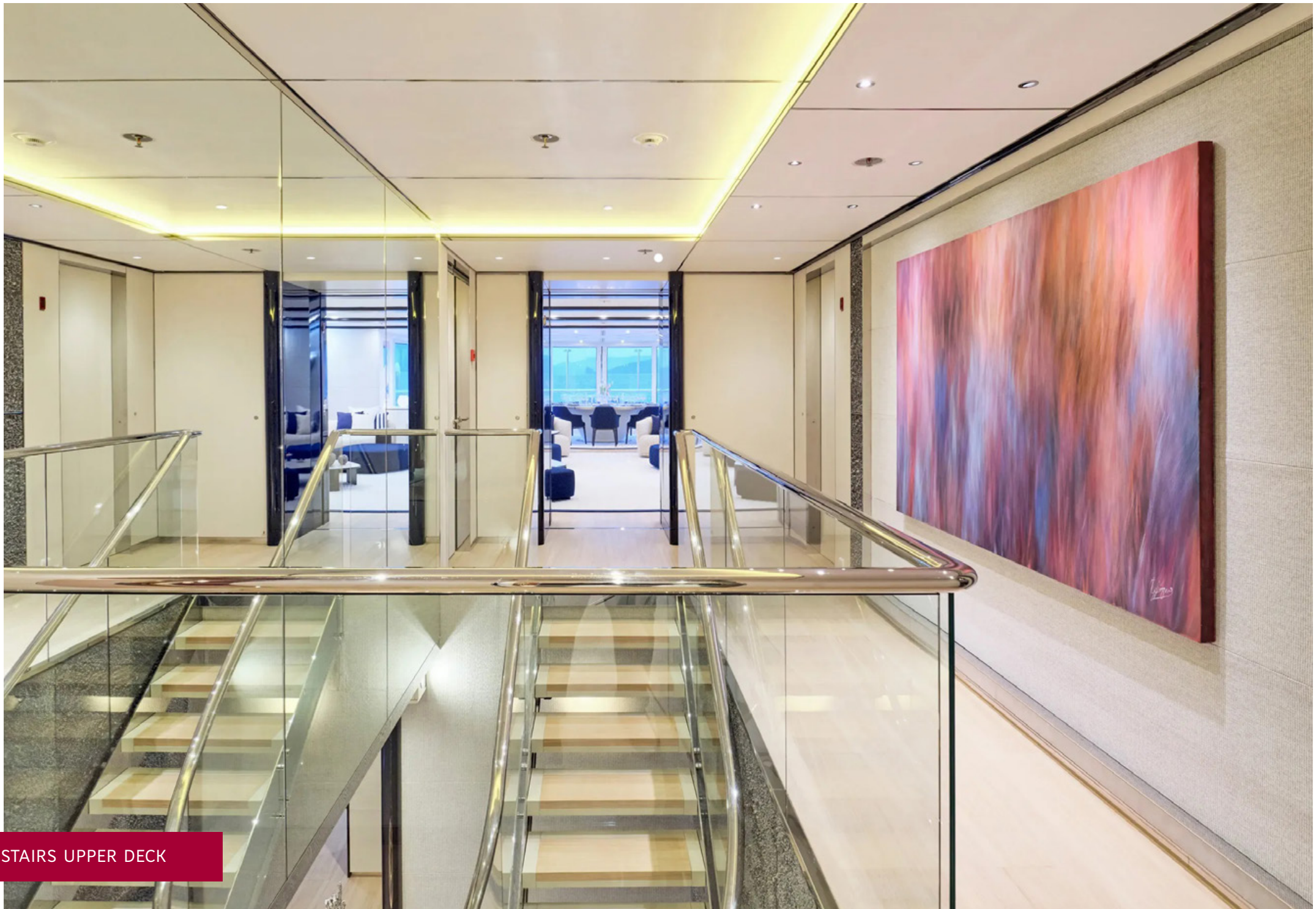
STAIRS UPPER DECK