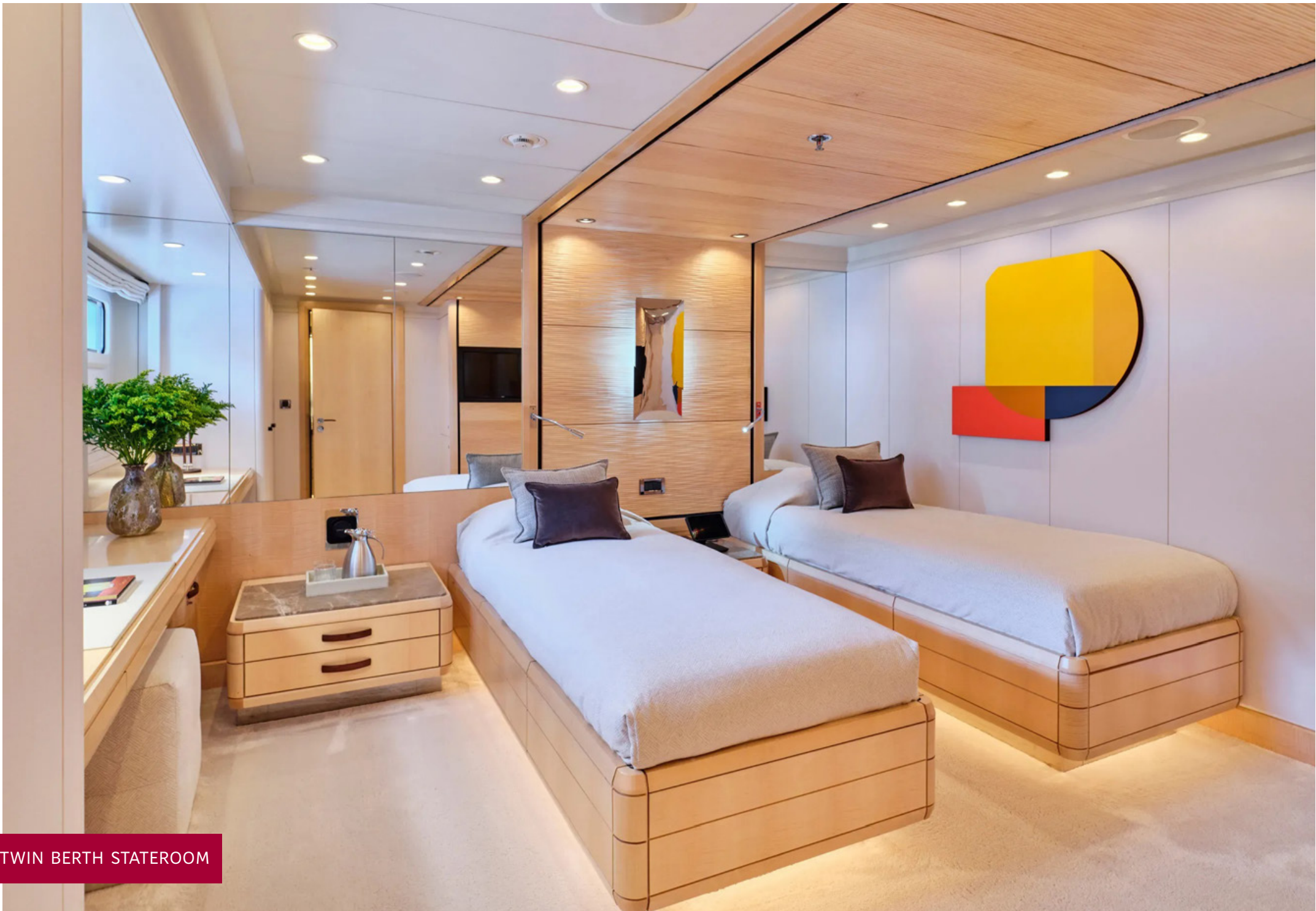
TWIN BERTH STATEROOM