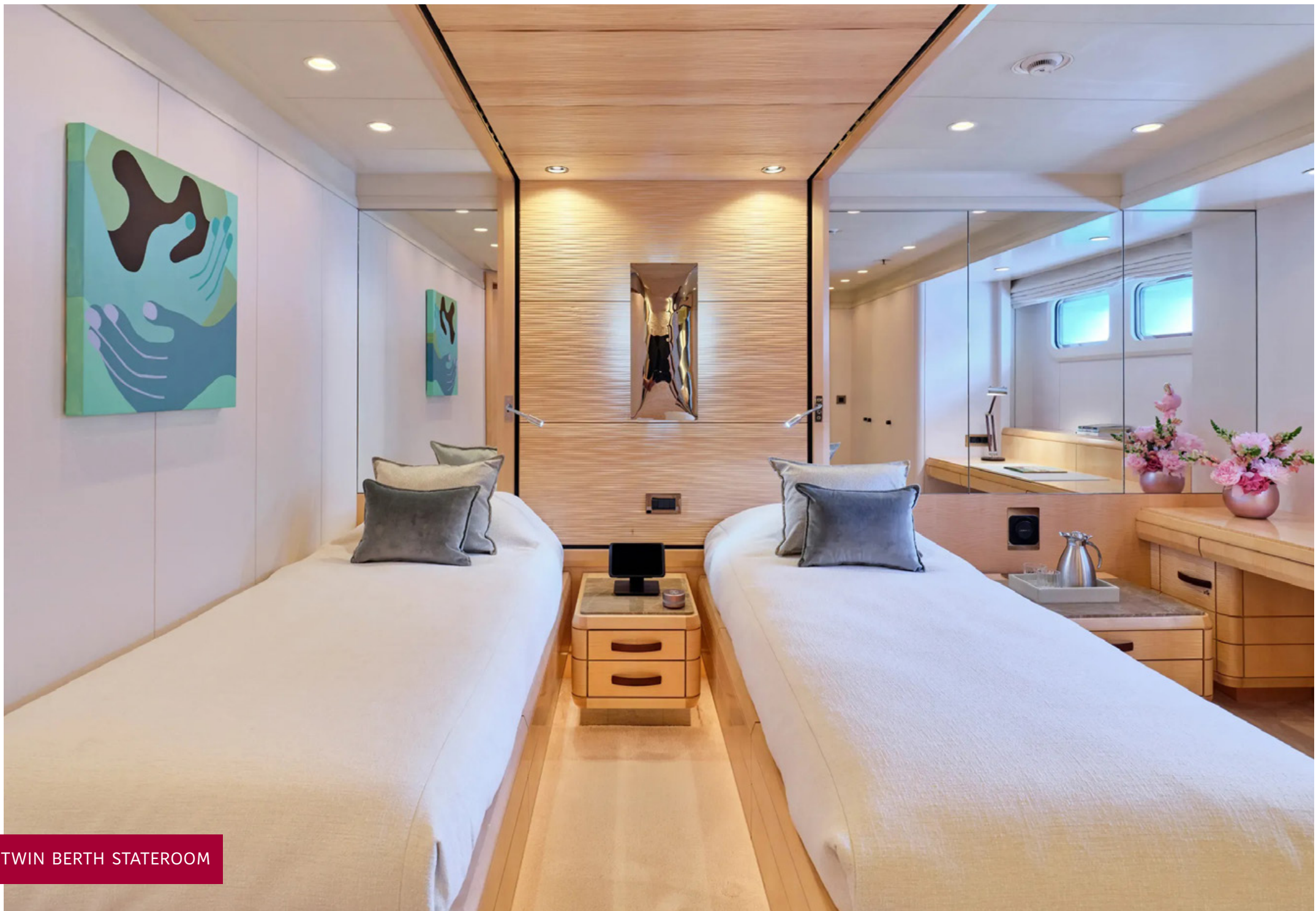
TWIN BERTH STATEROOM