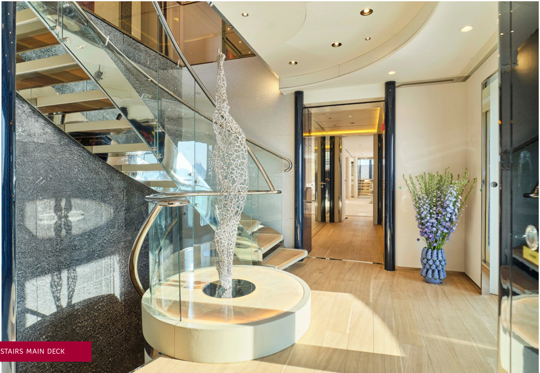
STAIRS MAIN DECK