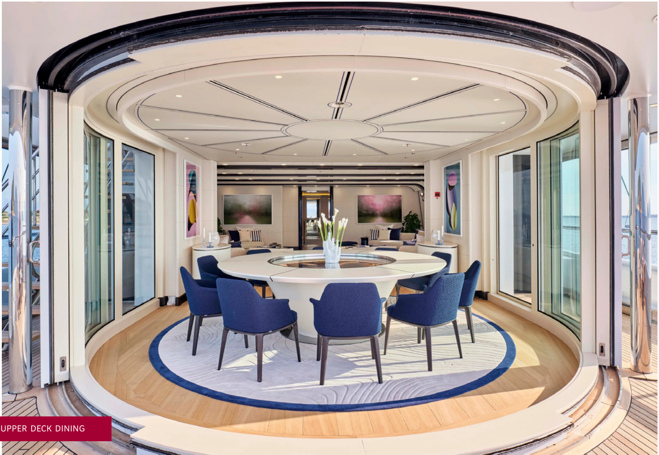
UPPER DECK DINING