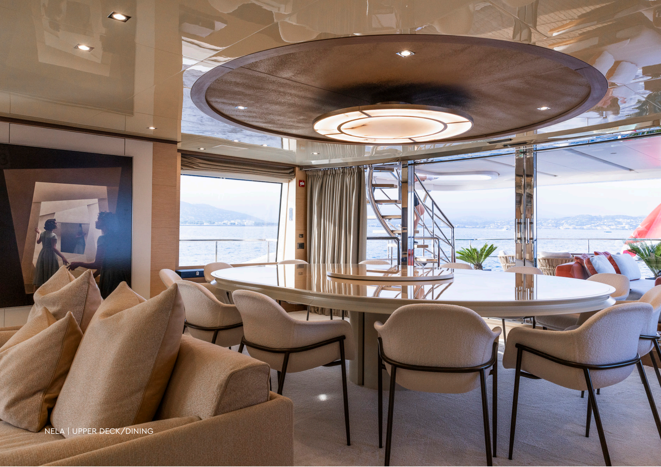
NELA | UPPER DECK/DINING