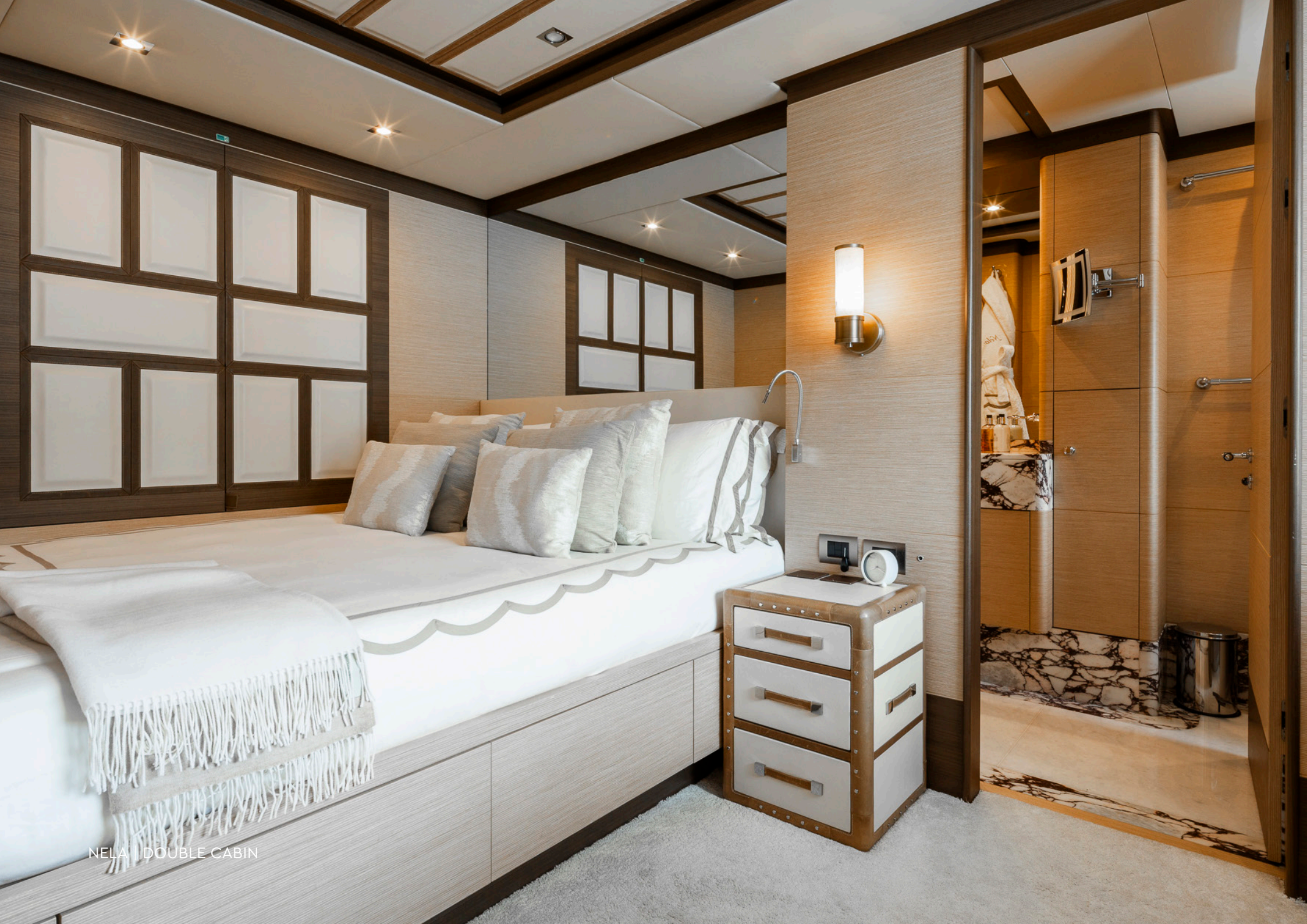
NELA | DOUBLE CABIN