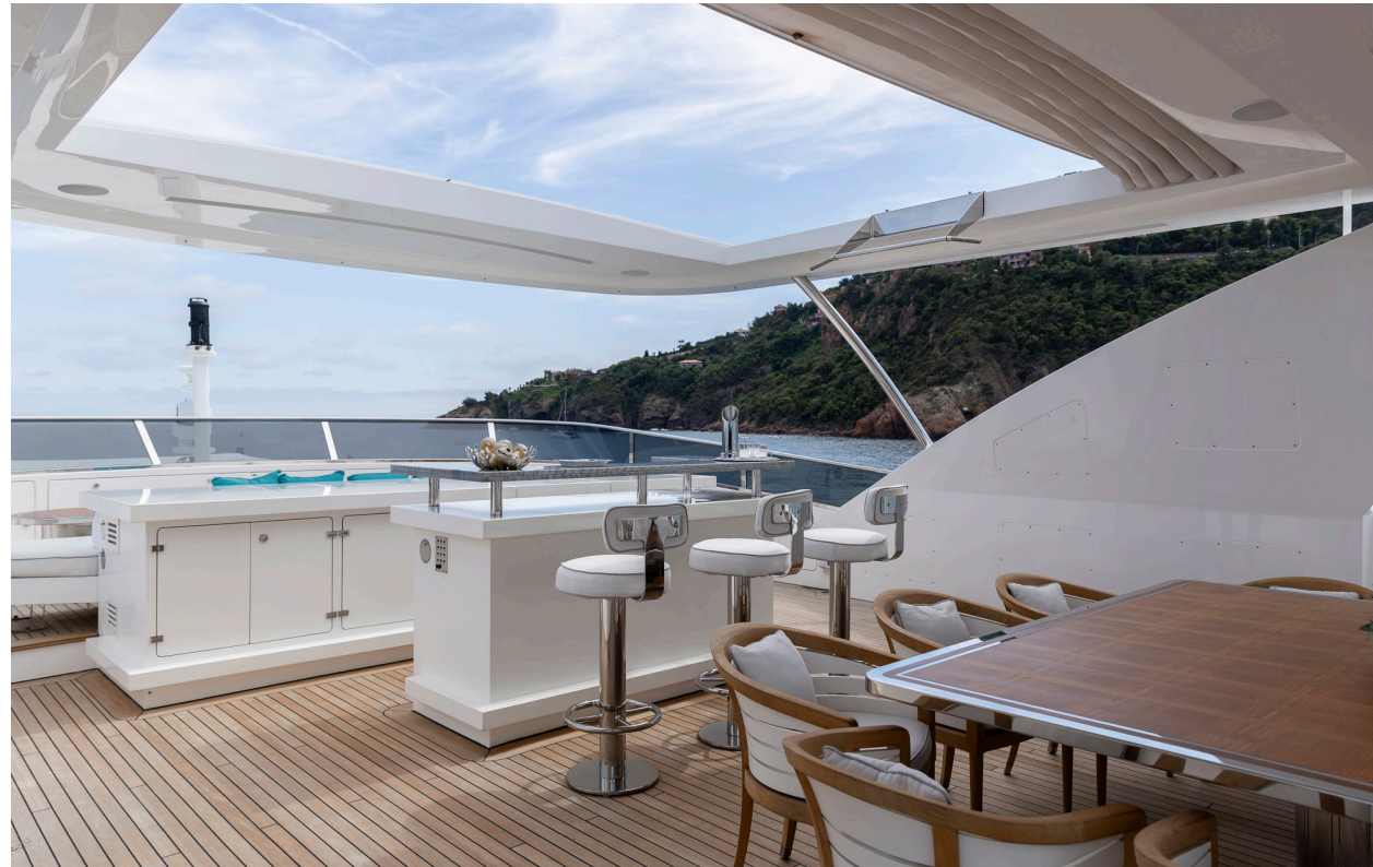
NELA | SUNDECK