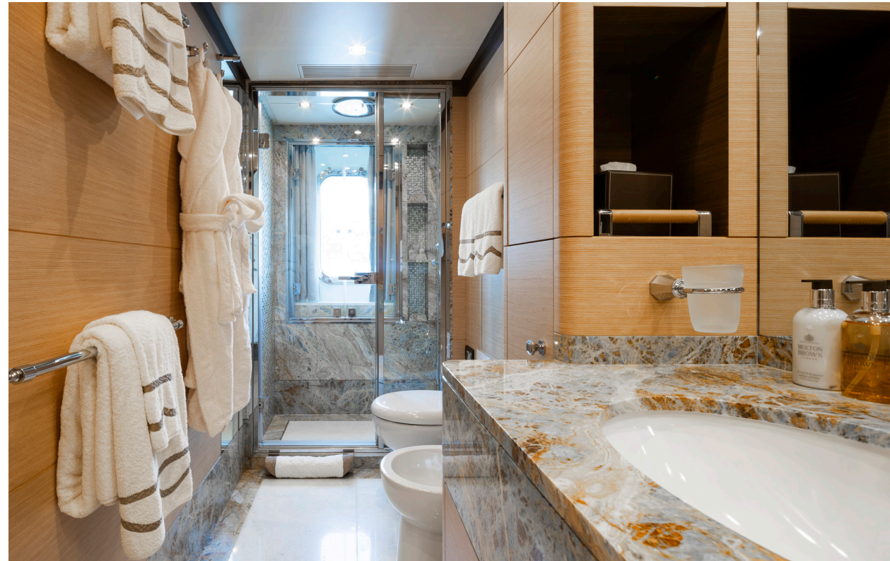
NELA | VIP EN SUITE