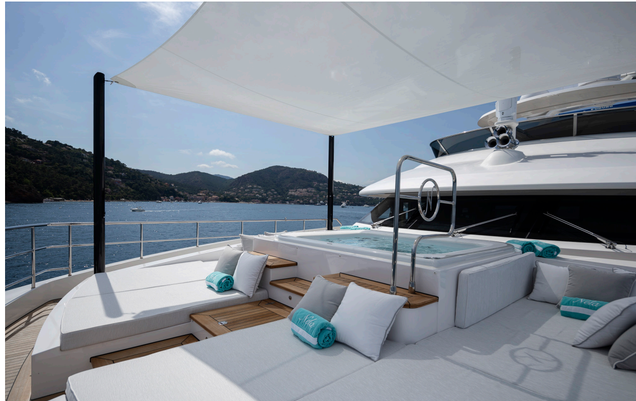
NELA | FOREDECK