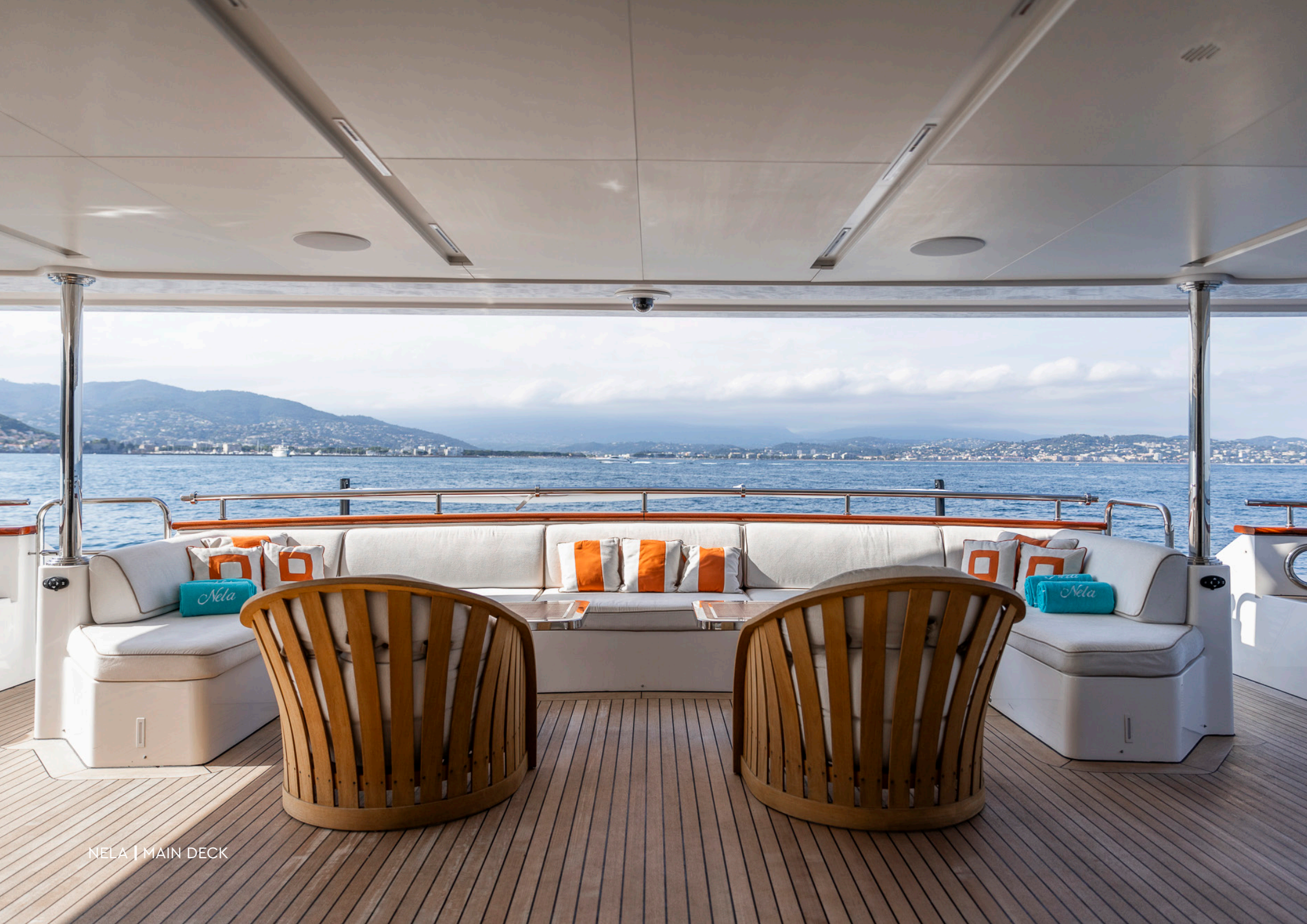
NELA | MAIN DECK