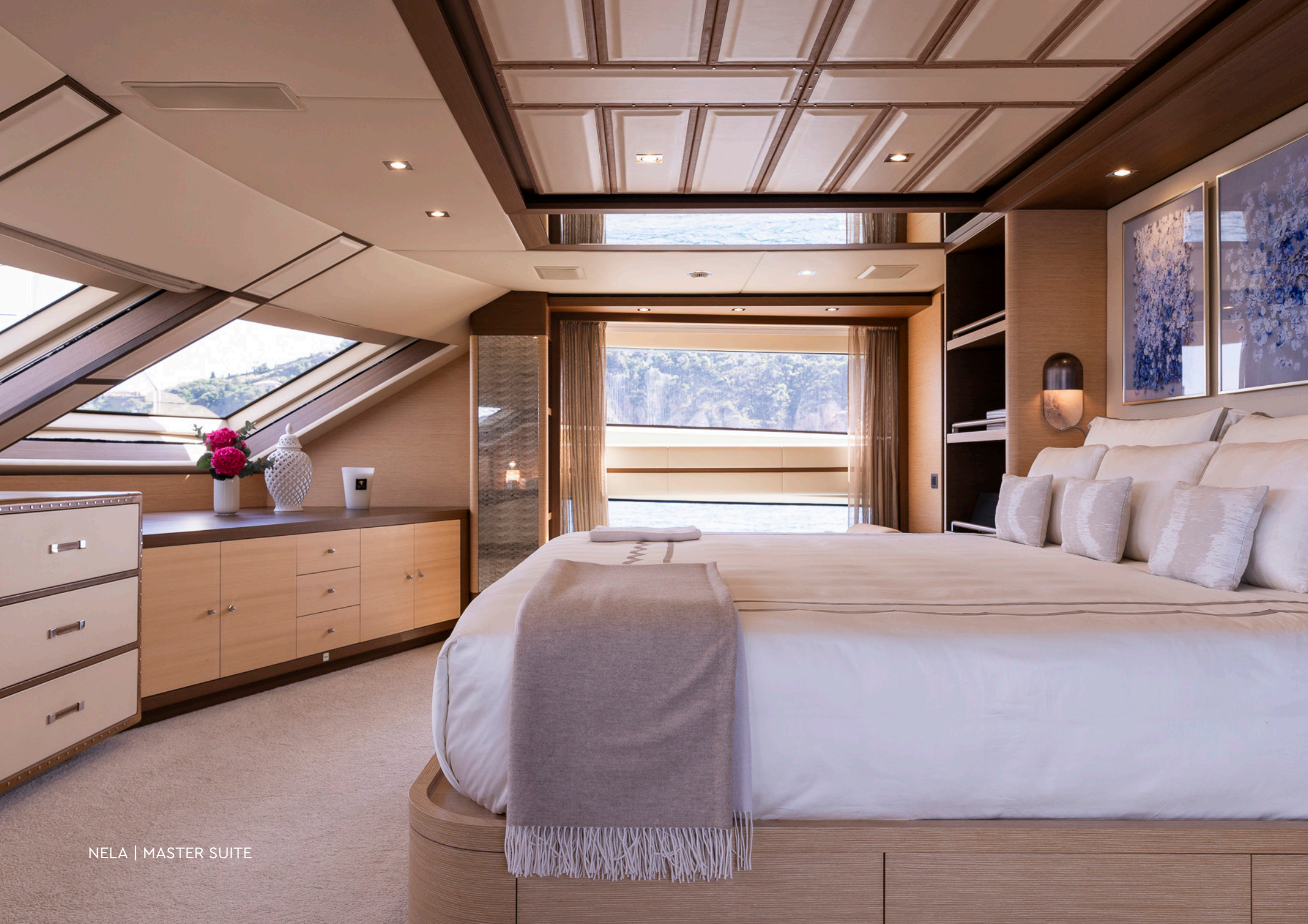
NELA | MASTER SUITE