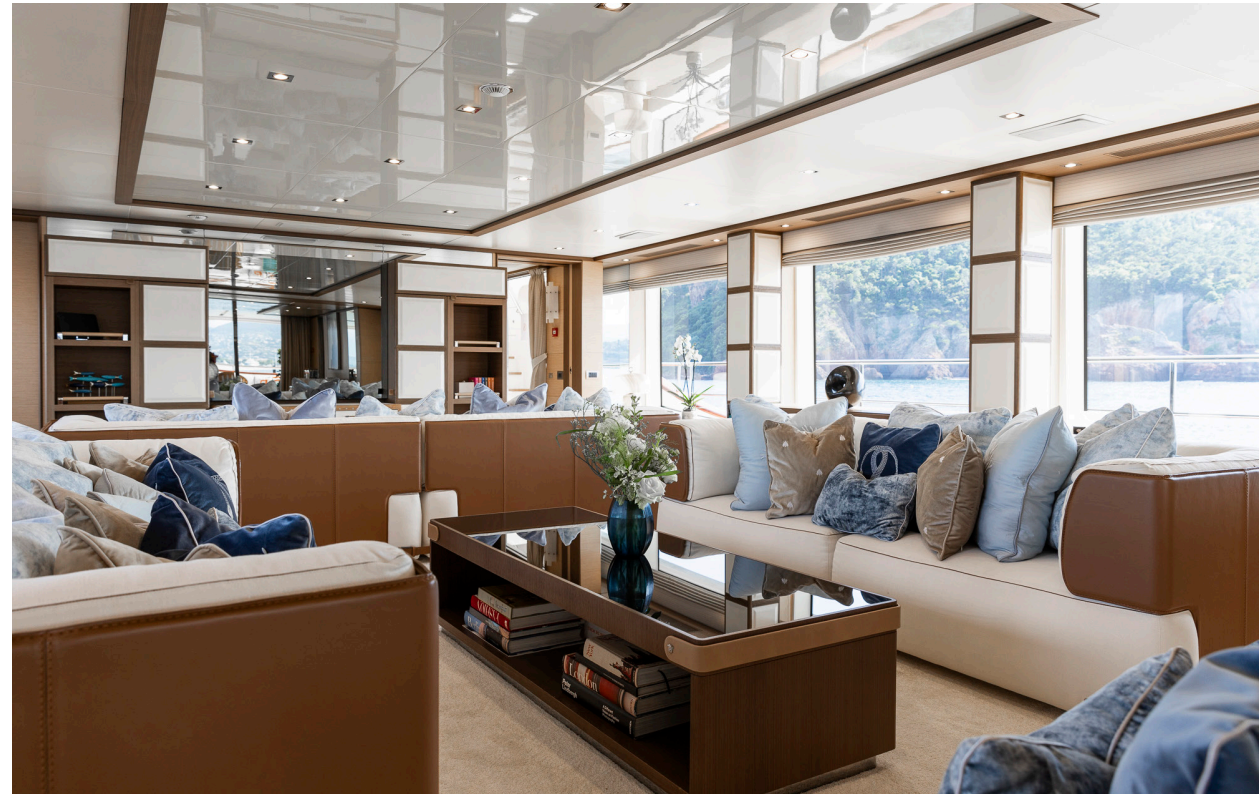
NELA | MAIN SALON