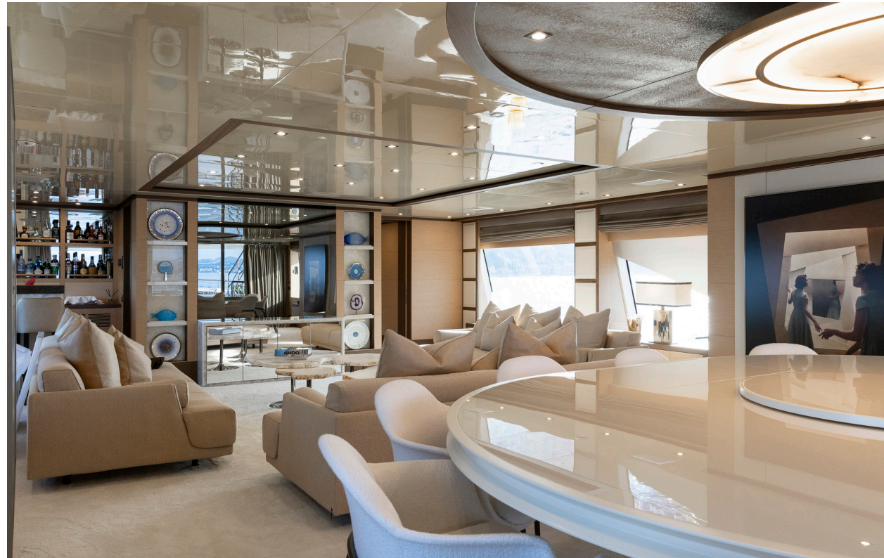
NELA | UPPER DECK