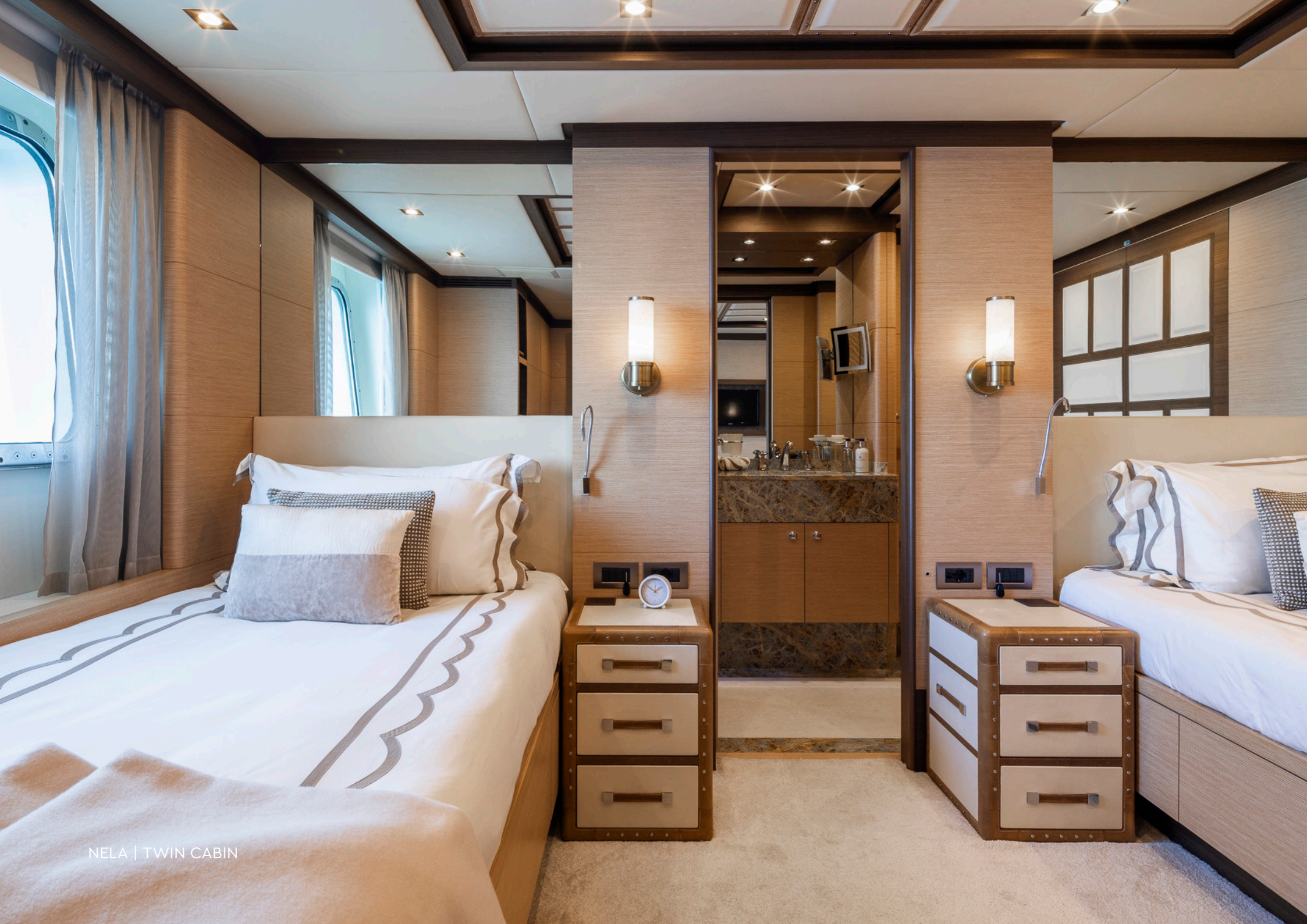
NELA | TWIN CABIN