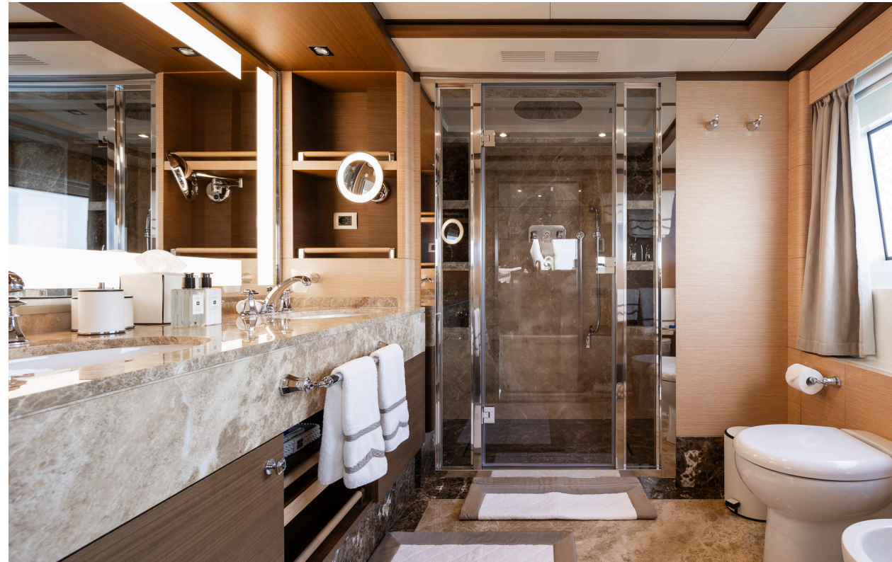
NELA | MASTER SUITE