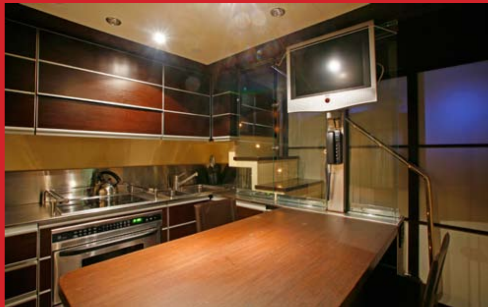
C-SHAPED COUNTER TOP & BACKSPLASH IN STAINLESS STEEL | 3 LEATHER HELM SEATS