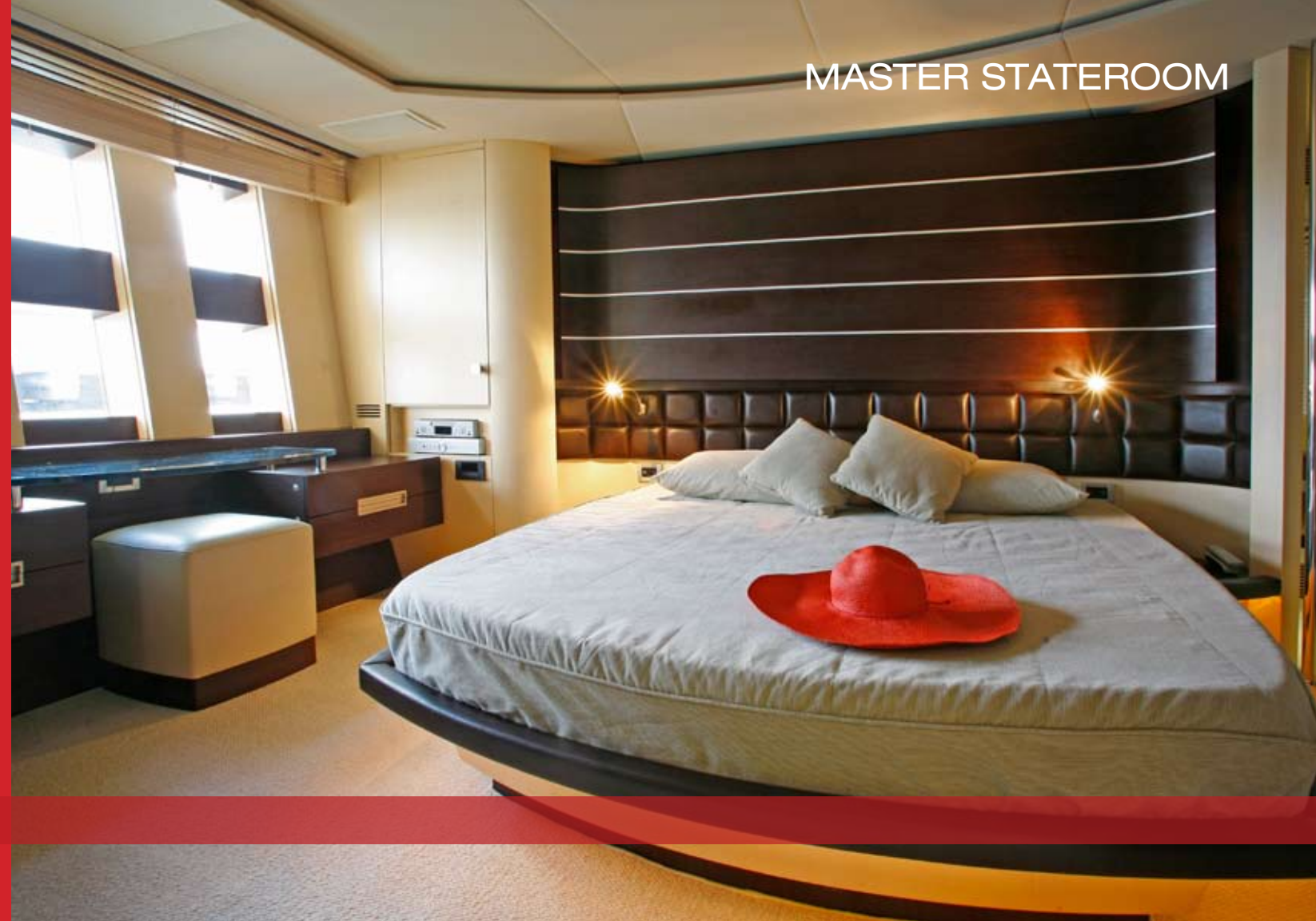
KING BED WITH SPECTACULAR VIEWS | VANITY WITH GLASS COUNTER TOP