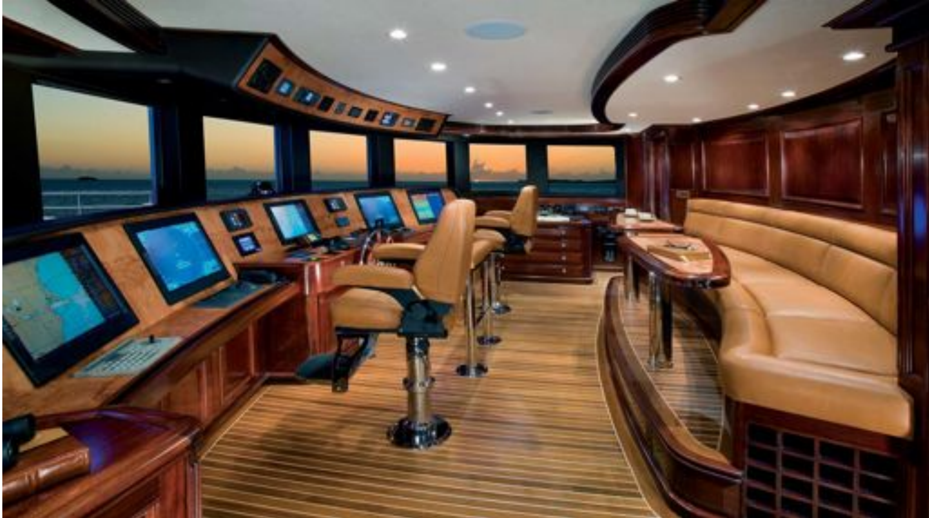
The pilot house