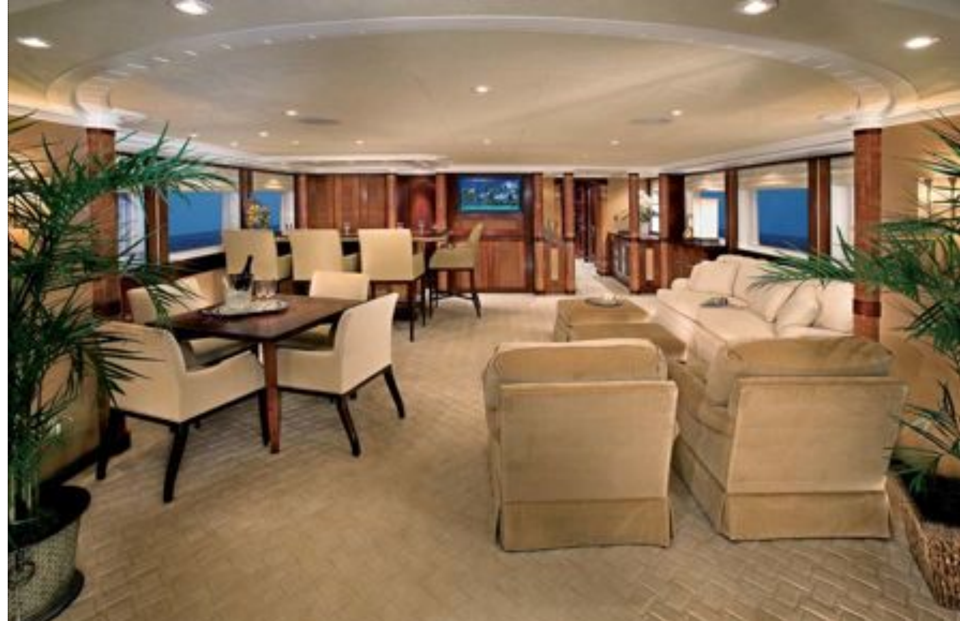
▲ ▼ The main saloon