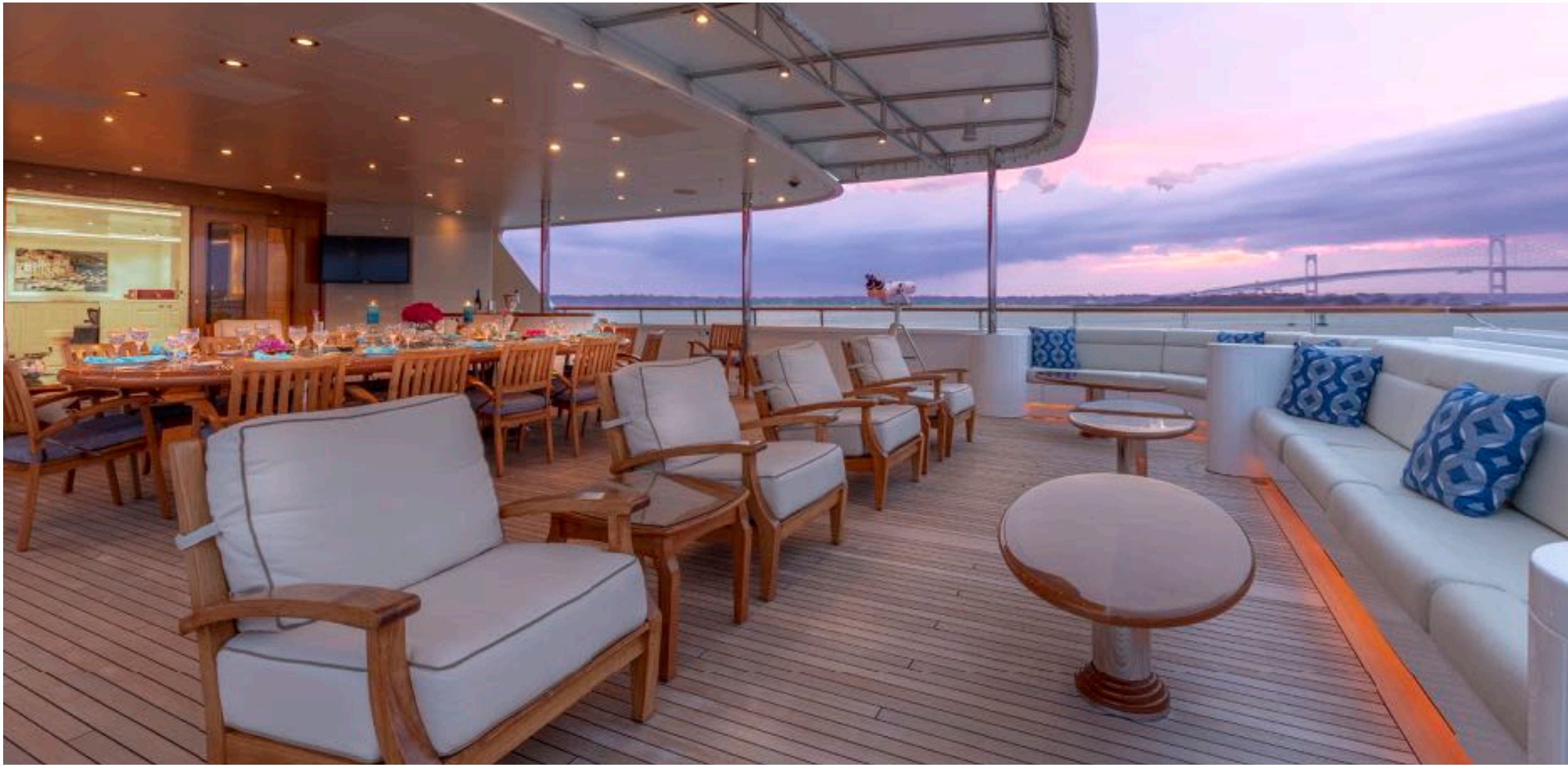
LUXURY CHARTER YACHT