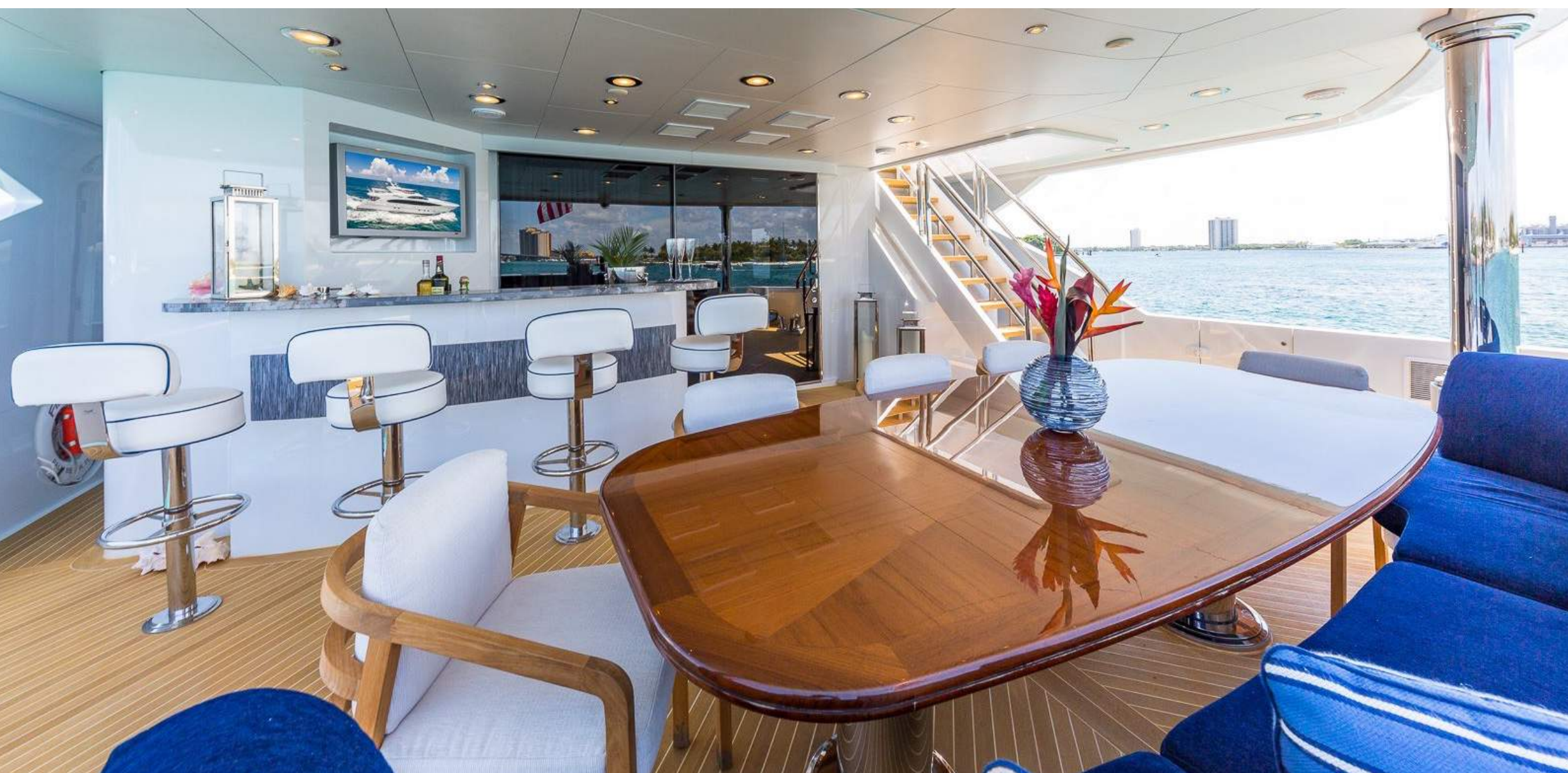
LUXURY CHARTER YACHT