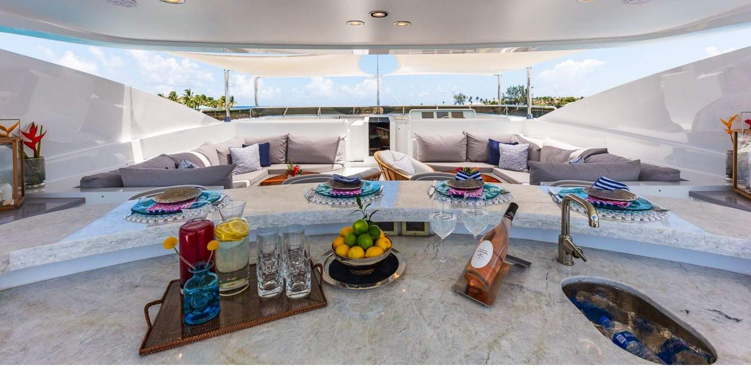
LUXURY CHARTER YACHT