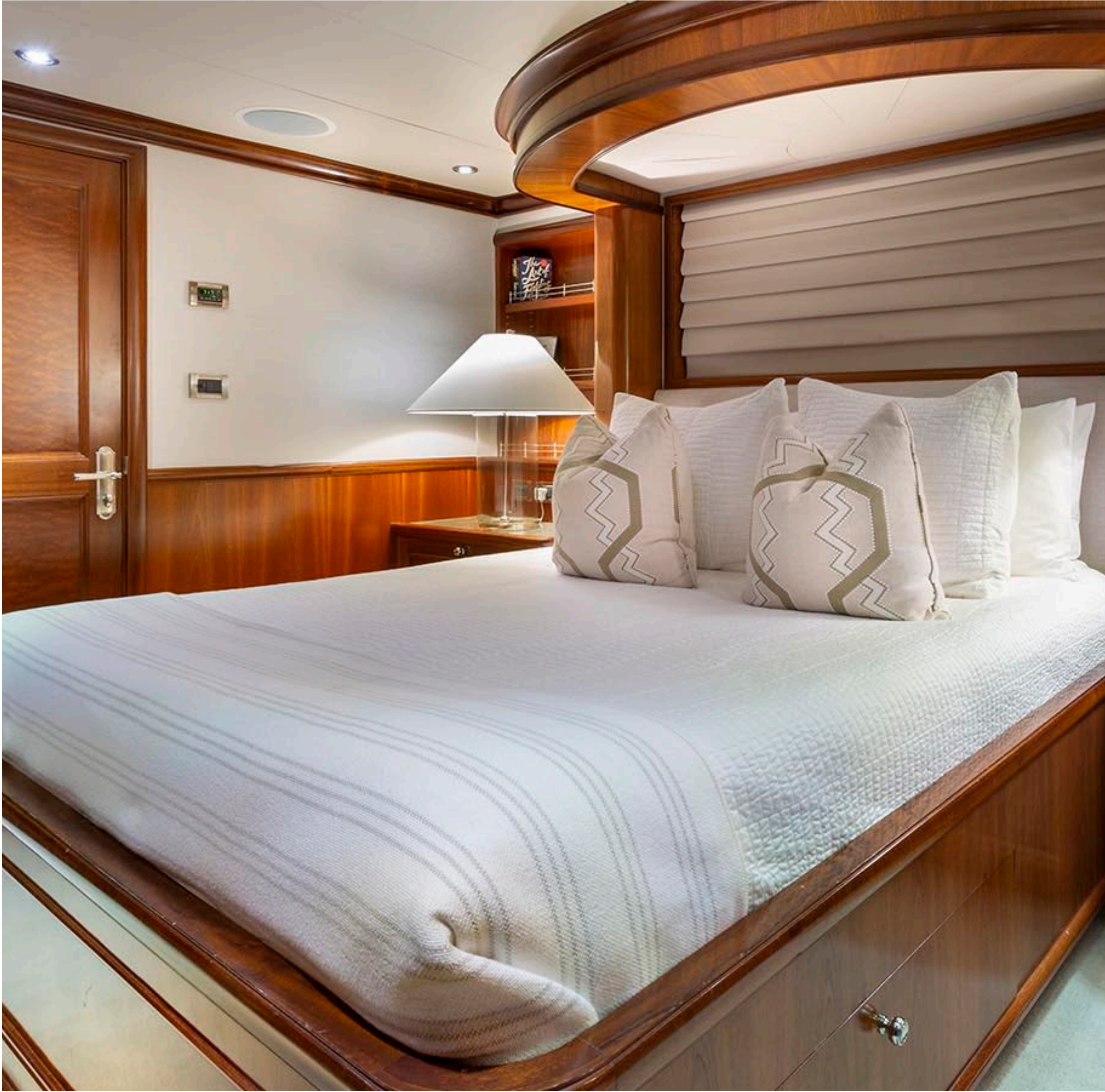
FAR FROM IT