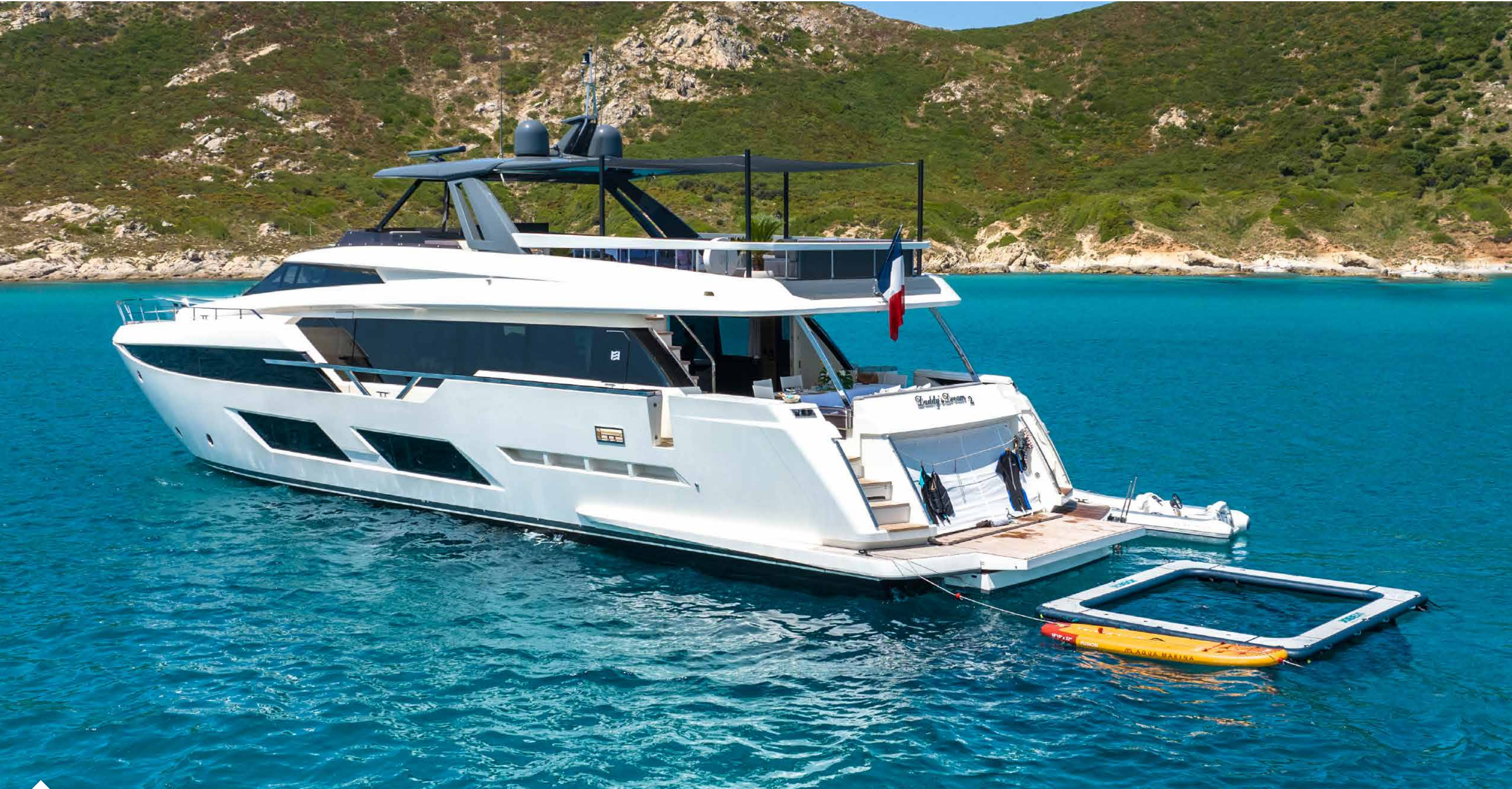
DADDY'S DREAM 2