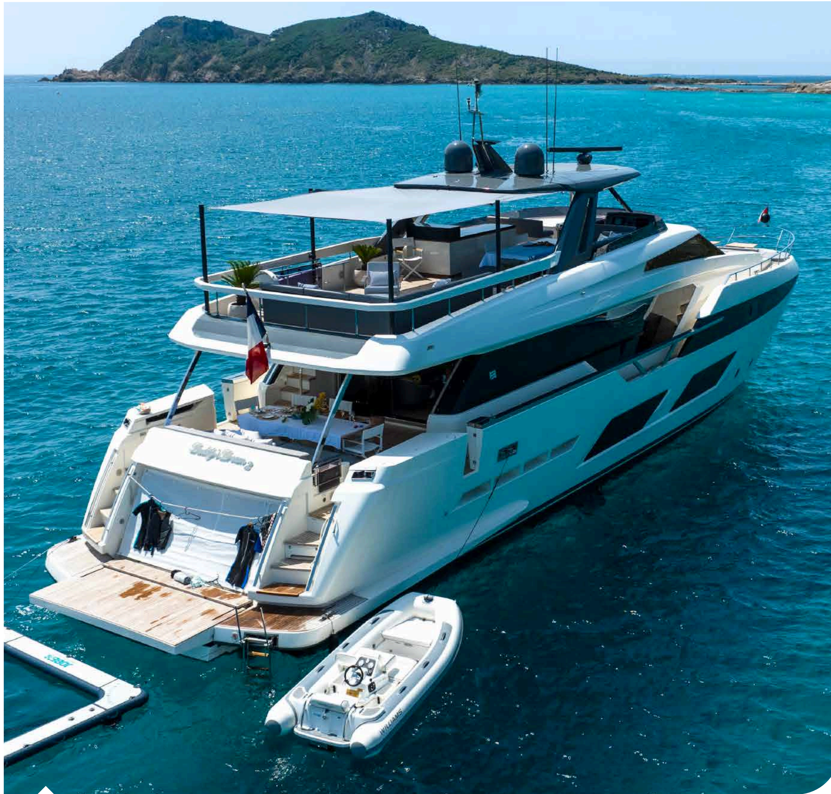
DADDY'S DREAM 2