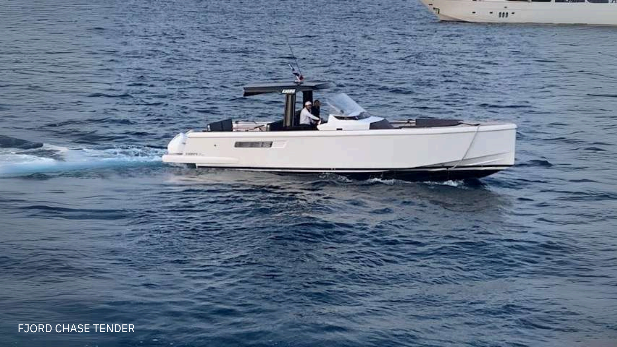
FJORD CHASE TENDER