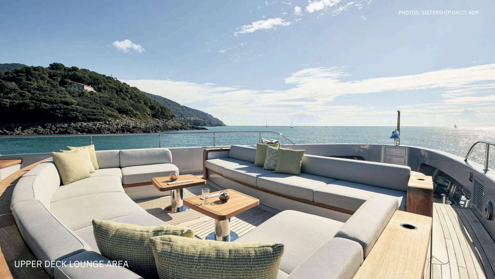
UPPER DECK LOUNGE AREA