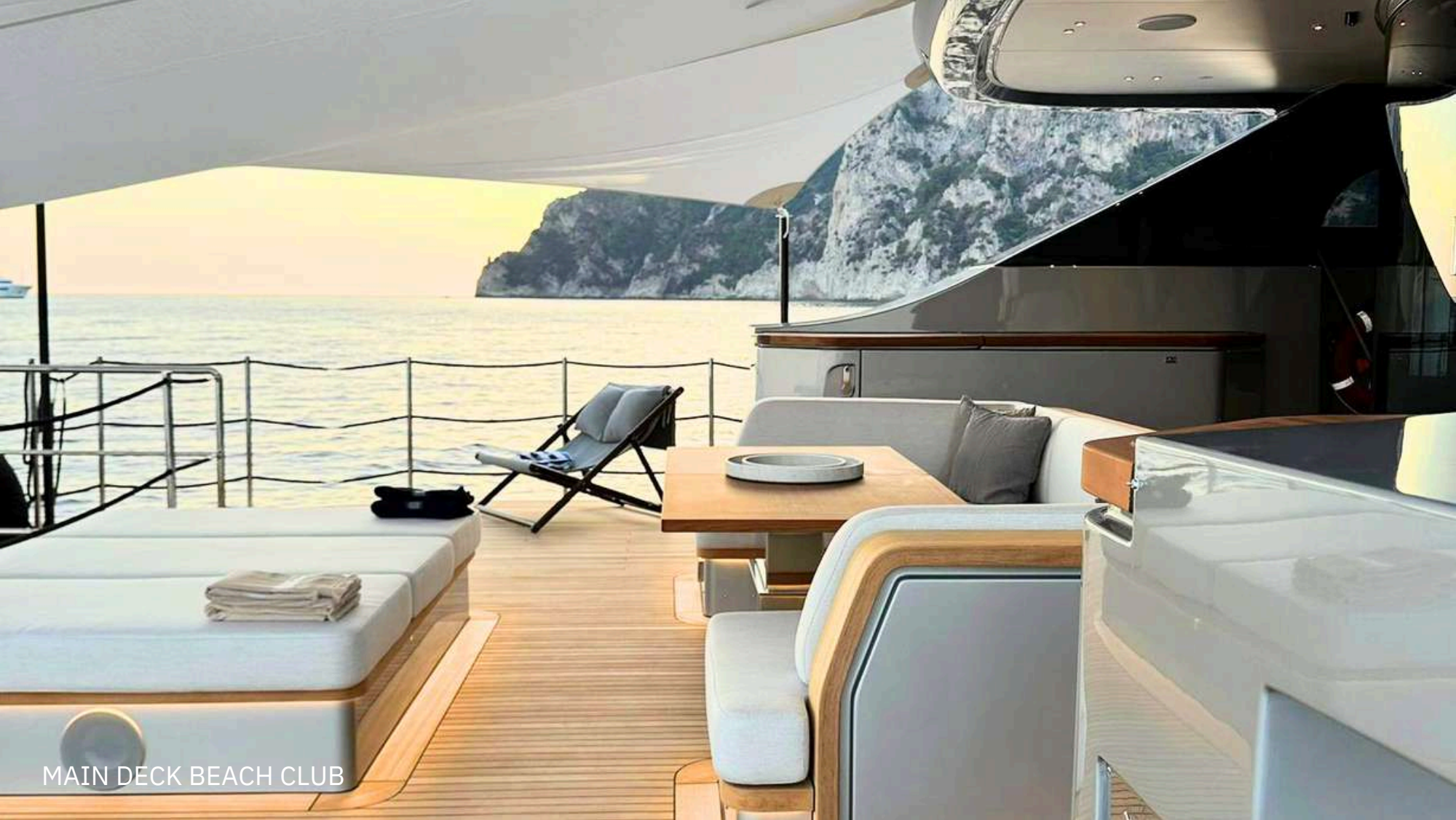
MAIN DECK BEACH CLUB