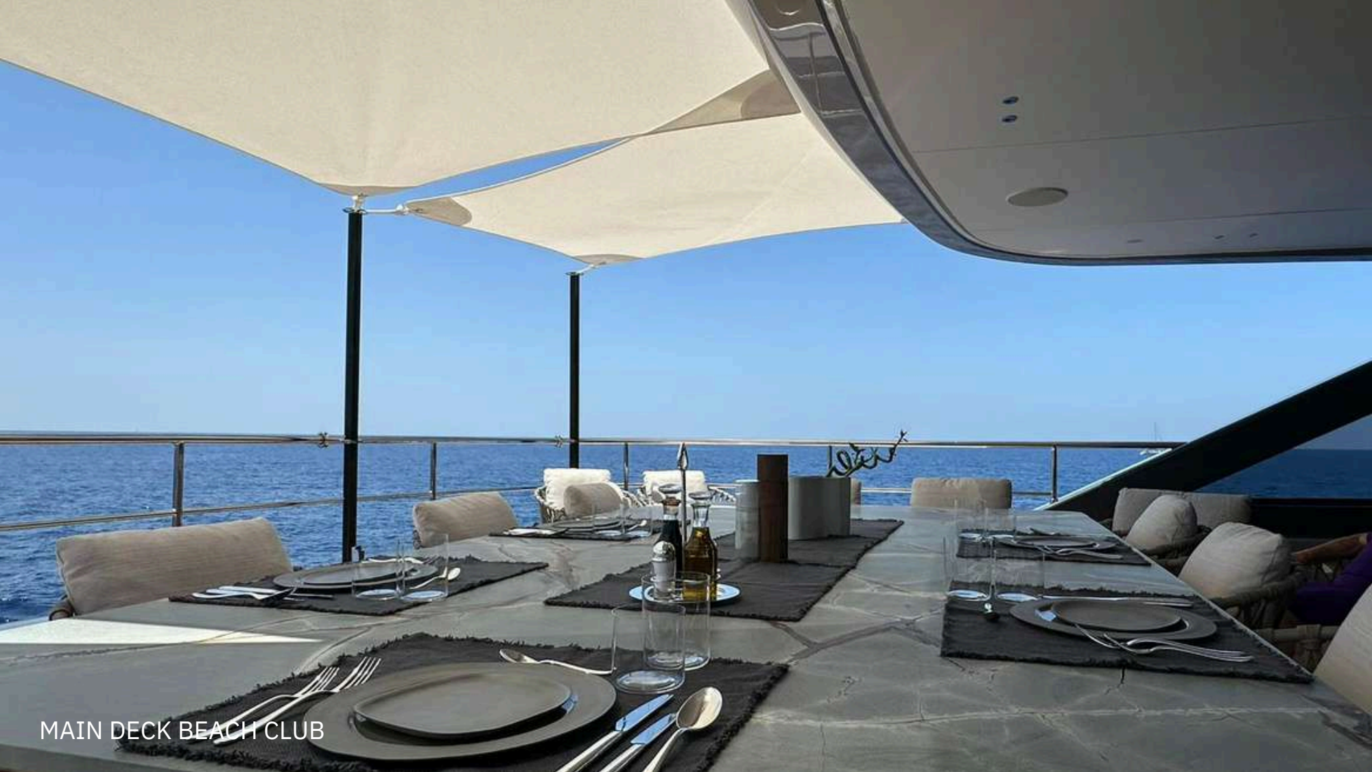
MAIN DECK BEACH CLUB