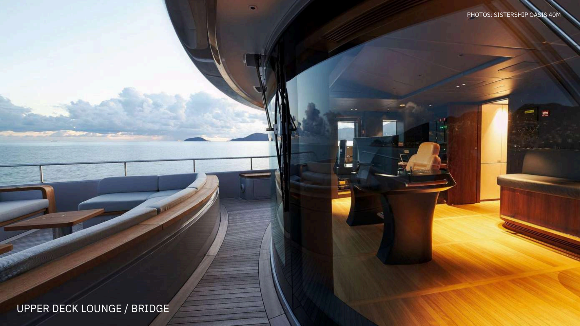
UPPER DECK LOUNGE / BRIDGE