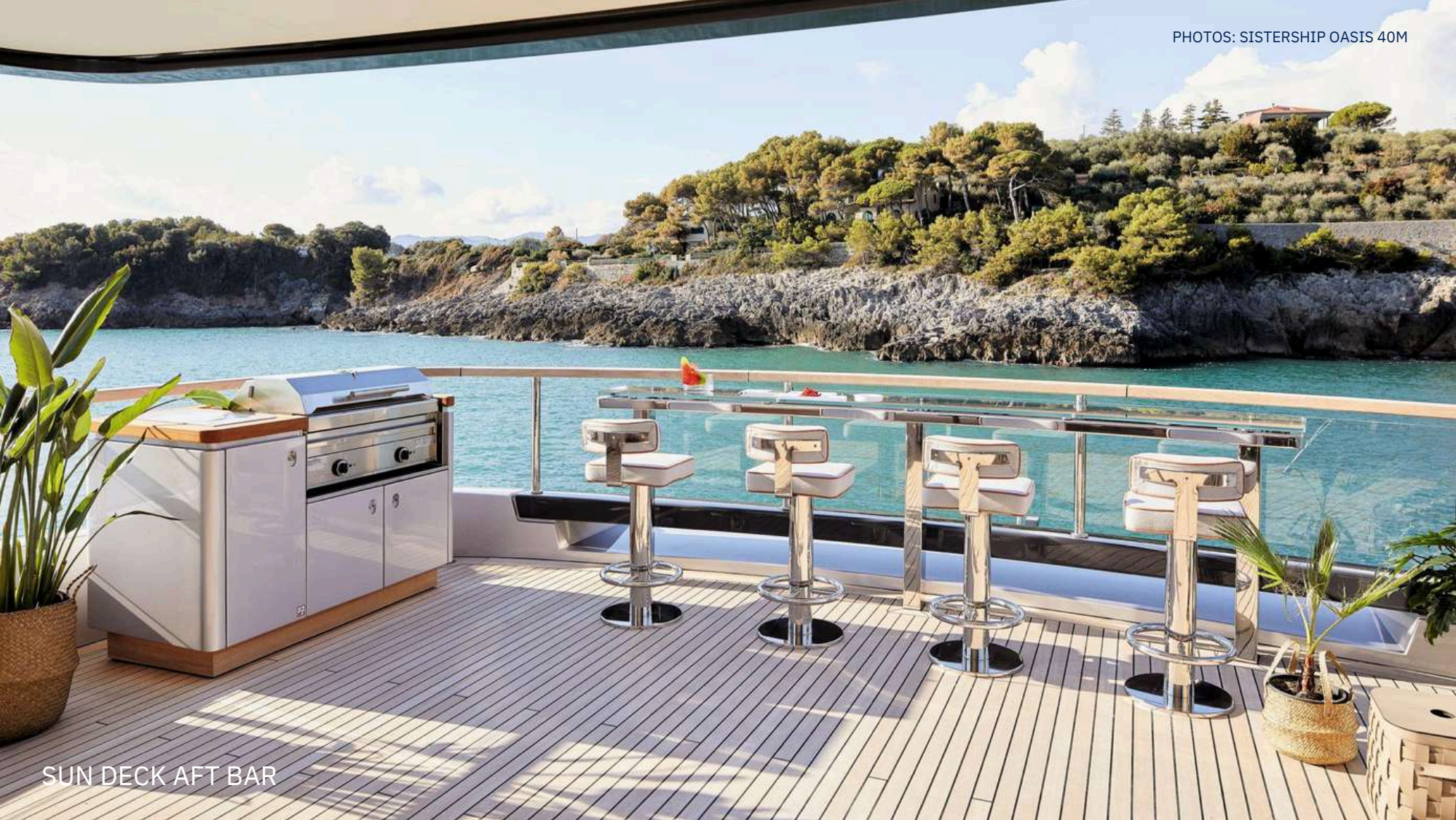
SUN DECK AFT BAR