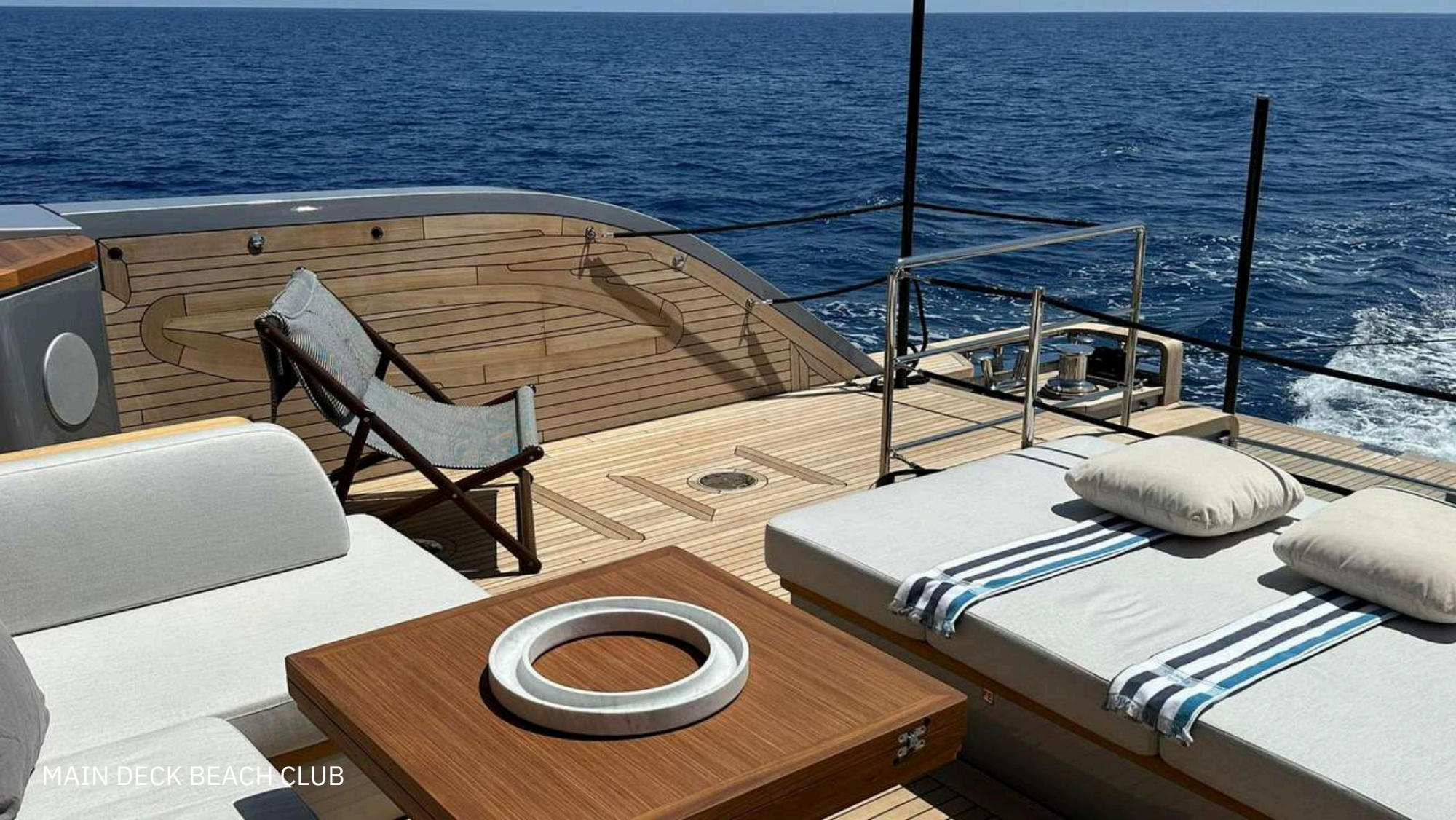
MAIN DECK BEACH CLUB