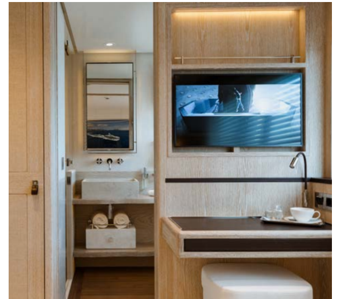
CONVERTIBLE/ TWIN CABIN