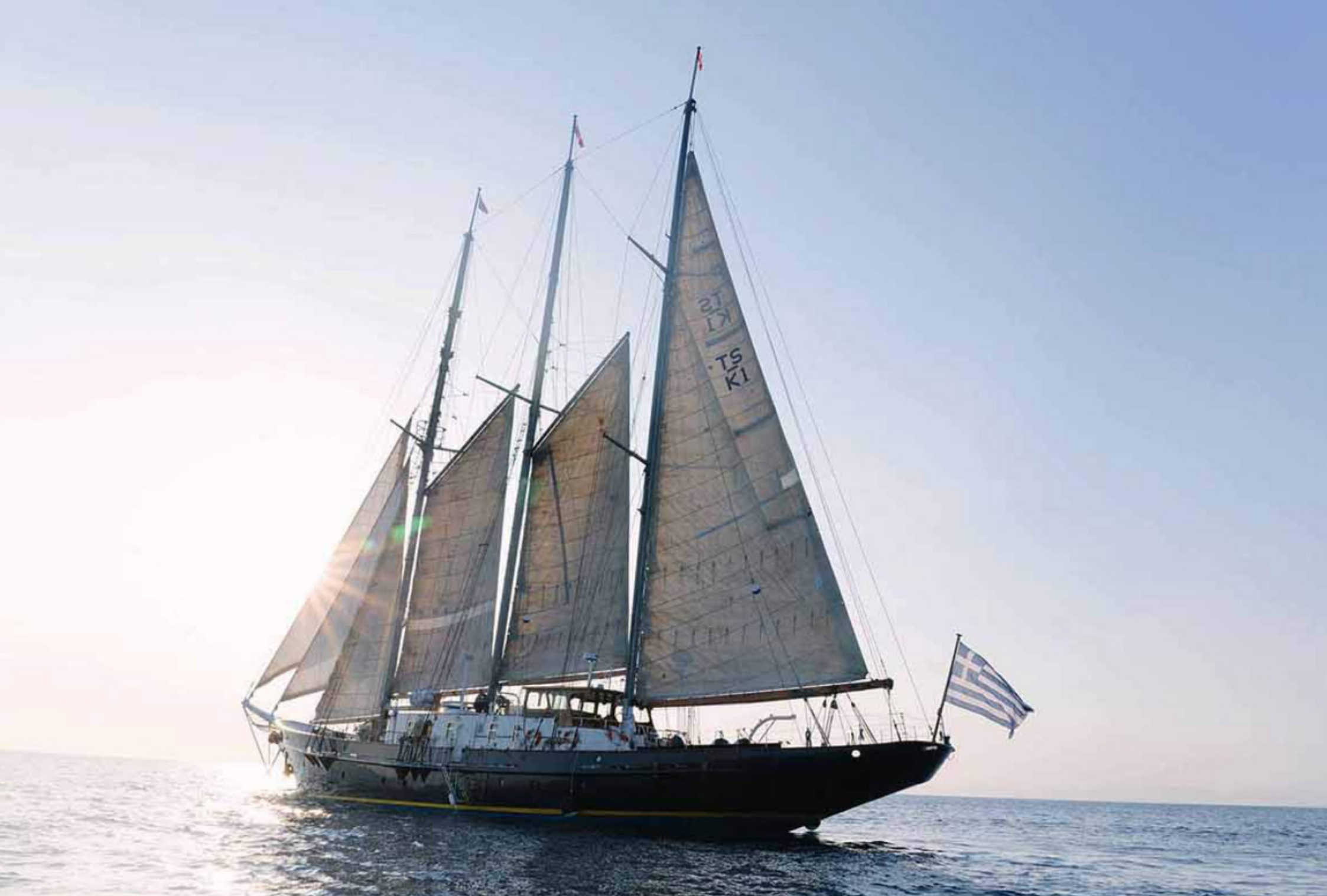
S/Y Sir Winston Churchill