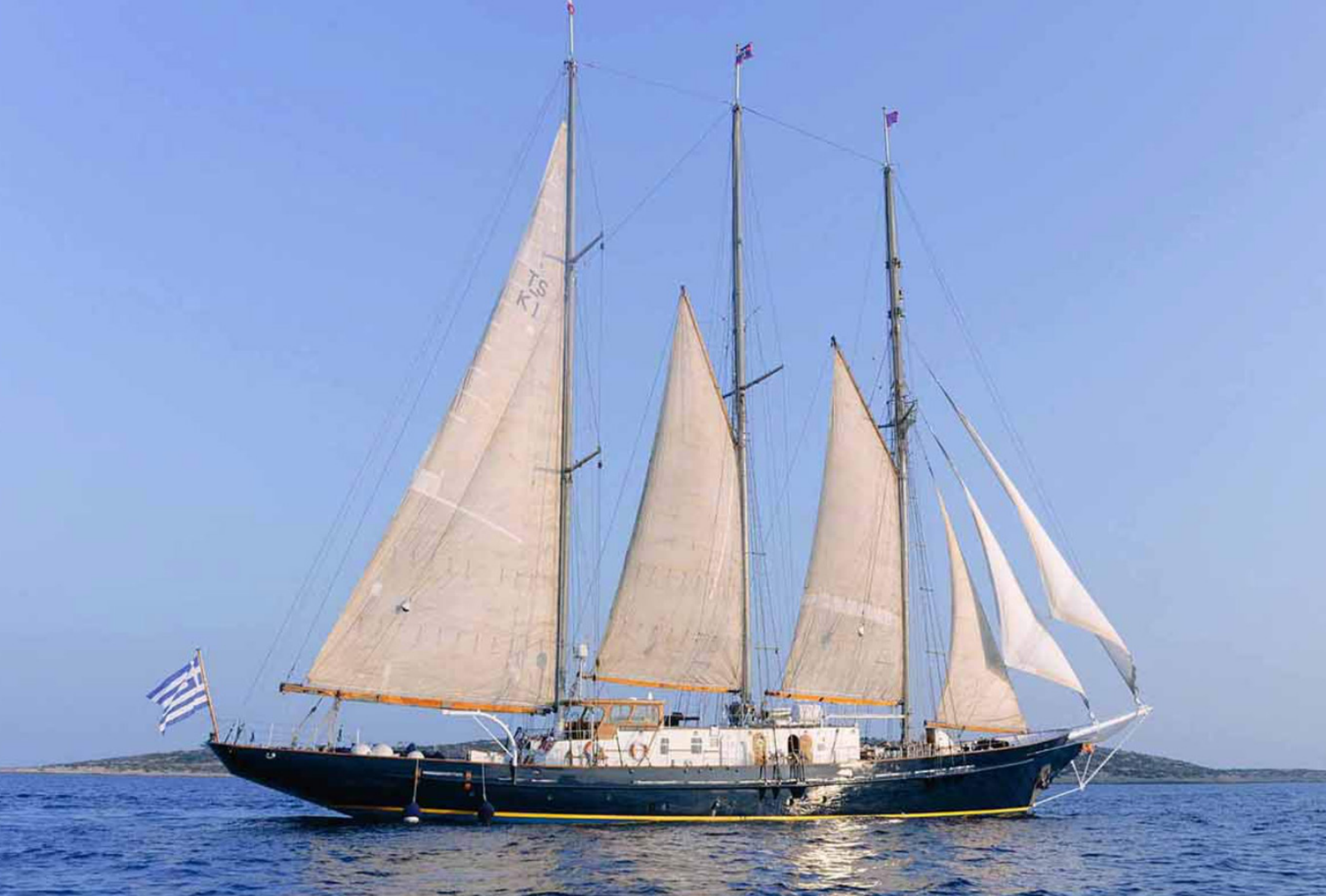
S/Y Sir Winston Churchill