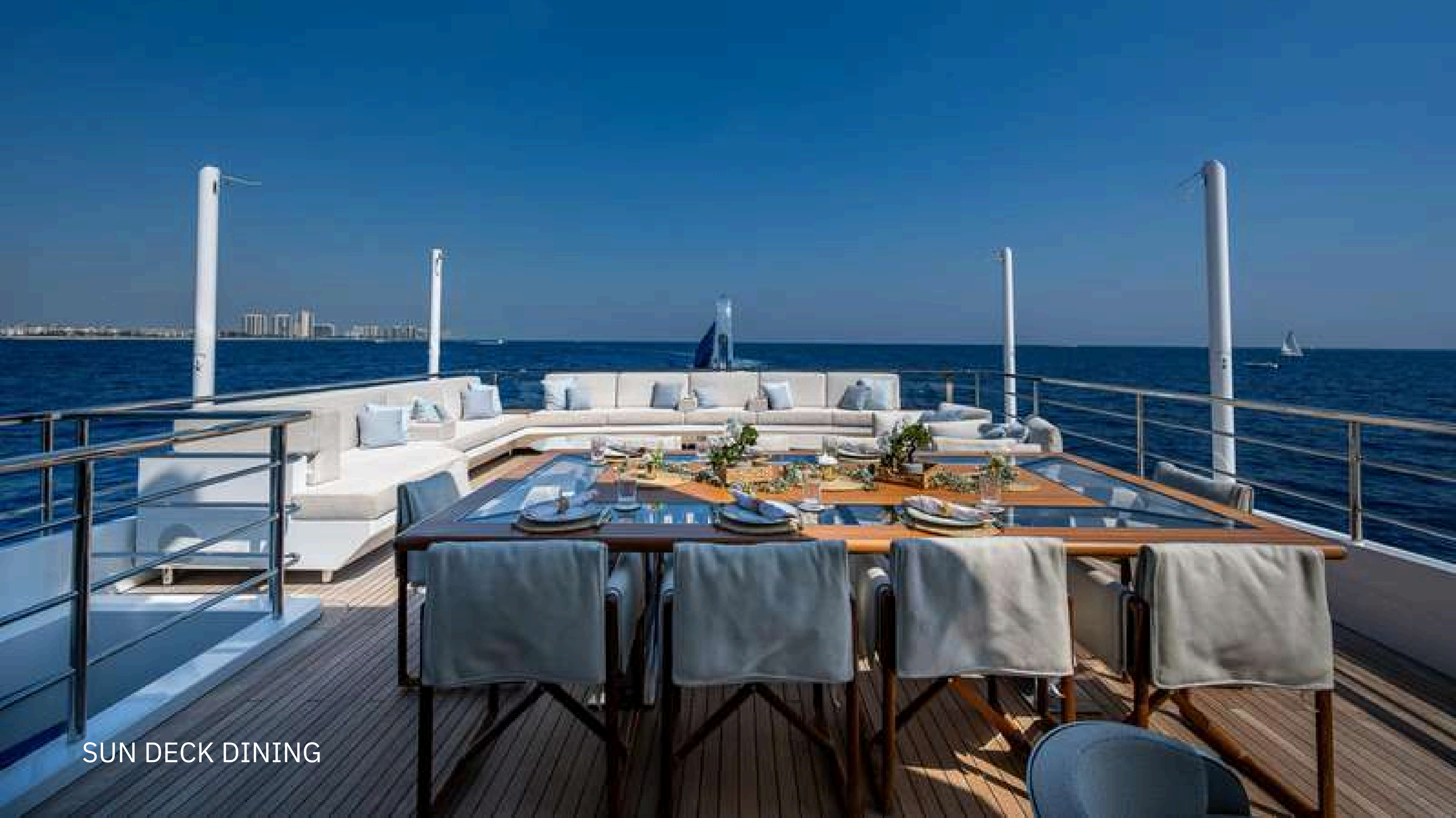
SUN DECK DINING