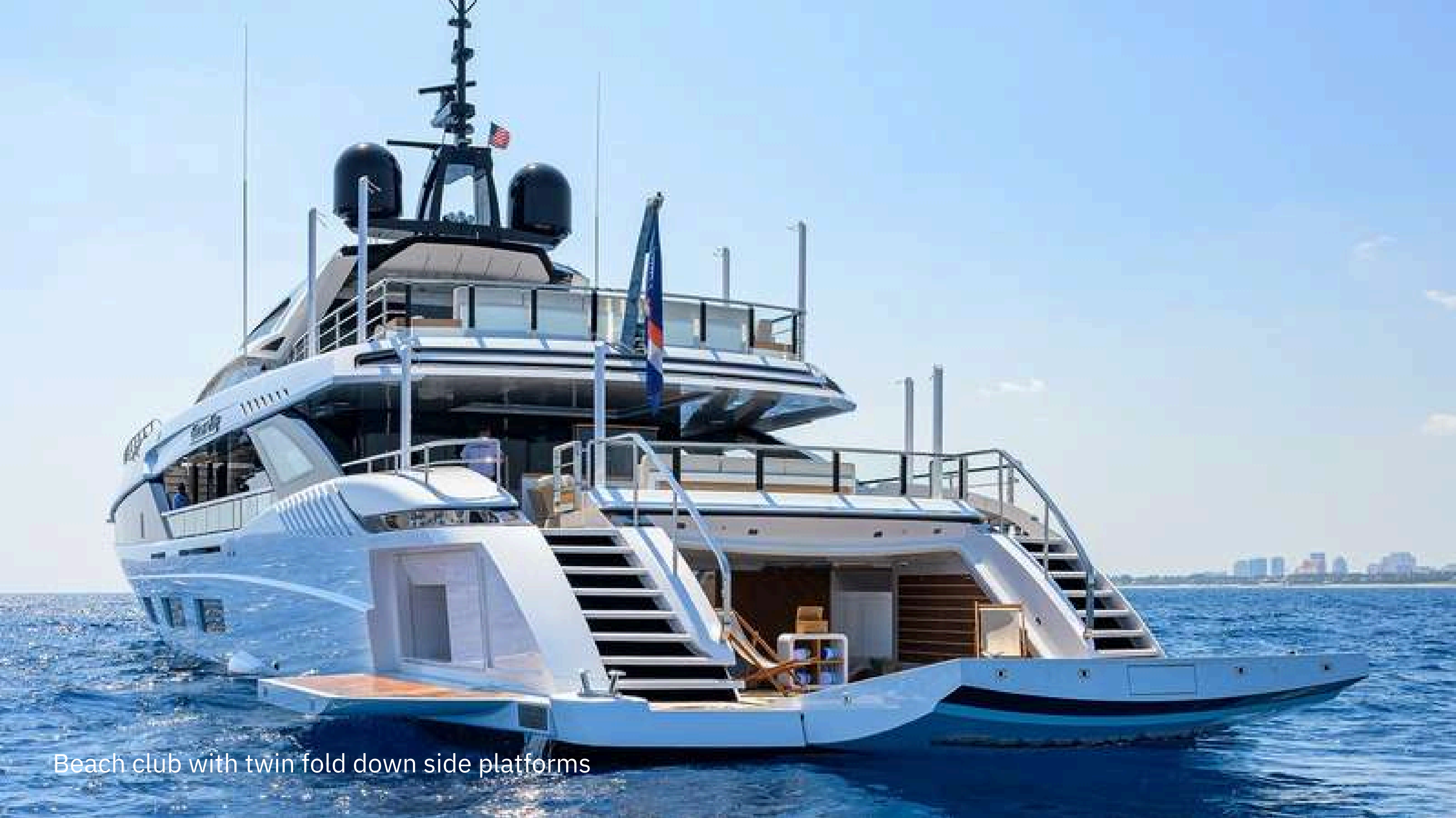
Beach club with twin fold down side platforms