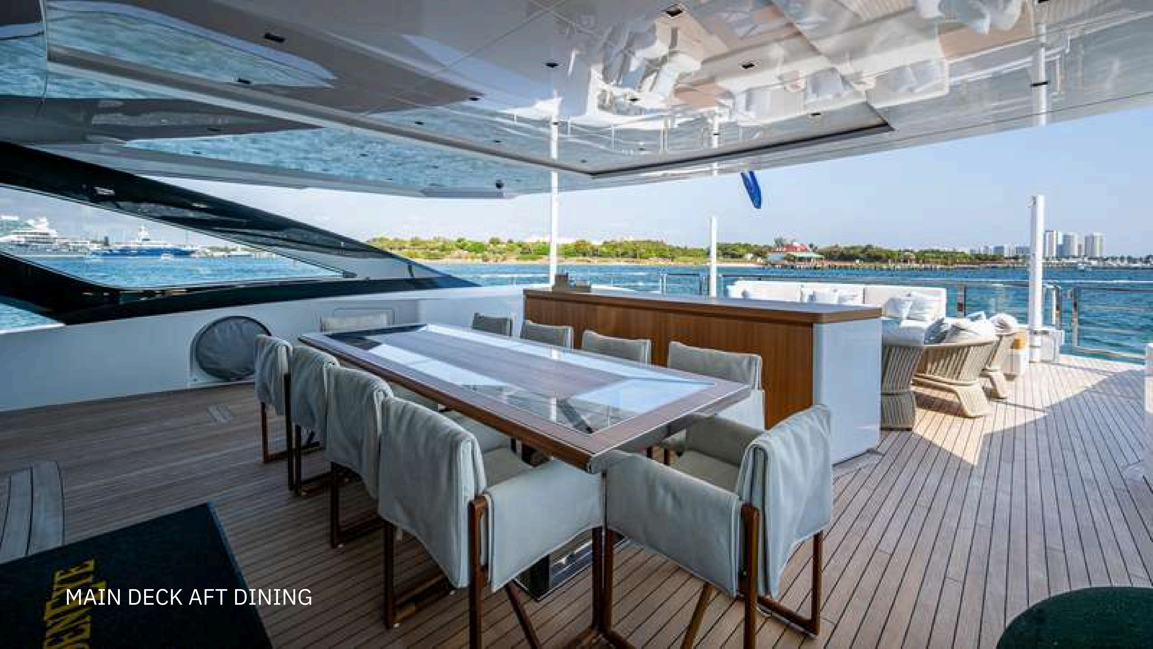
MAIN DECK AFT DINING