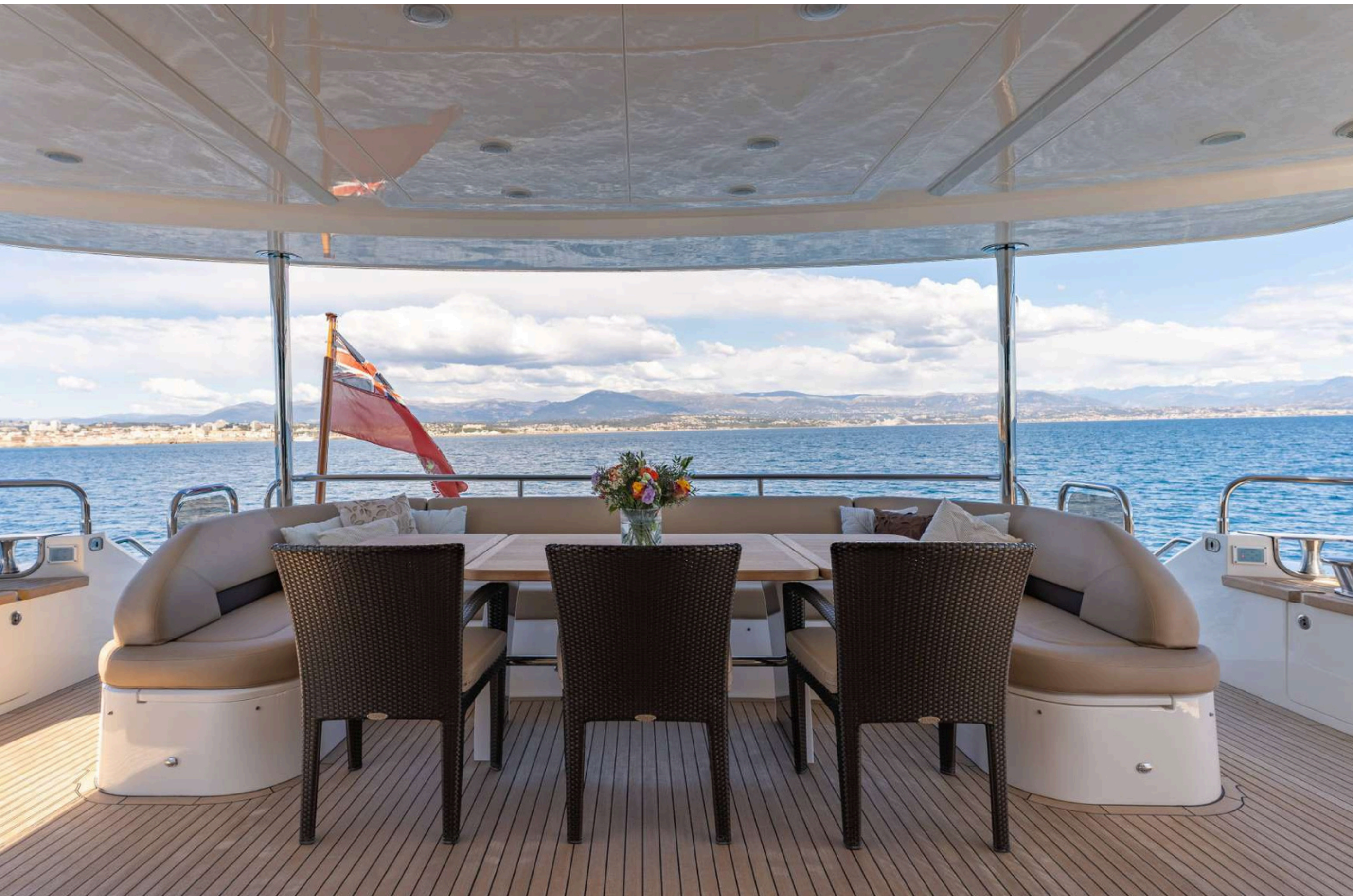
BLUE EYES | 95' (29.42m) | PRINCESS YACHTS | 2009/2024 - Main Deck Aft, Al Fresco Dining