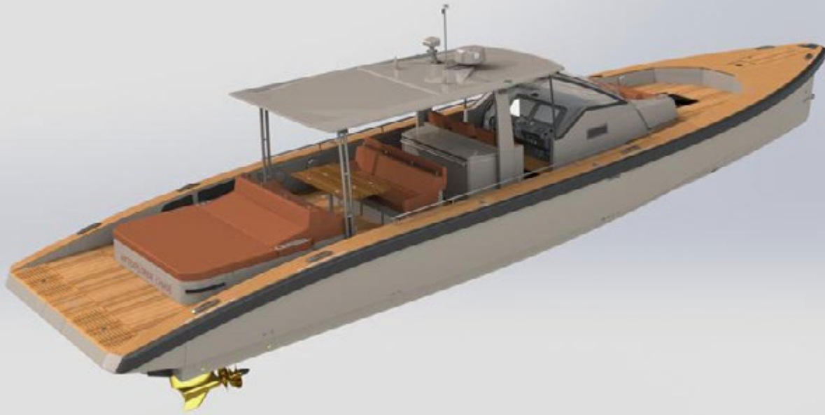
16M CHASE TENDER WINDY 52