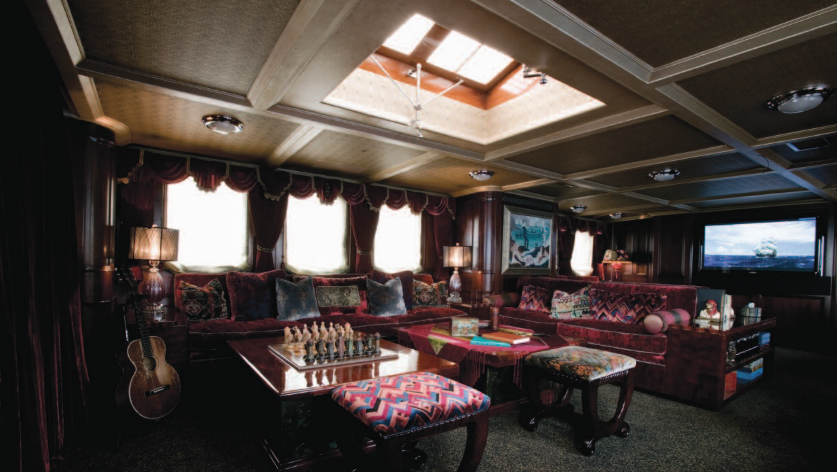
The Main Saloon