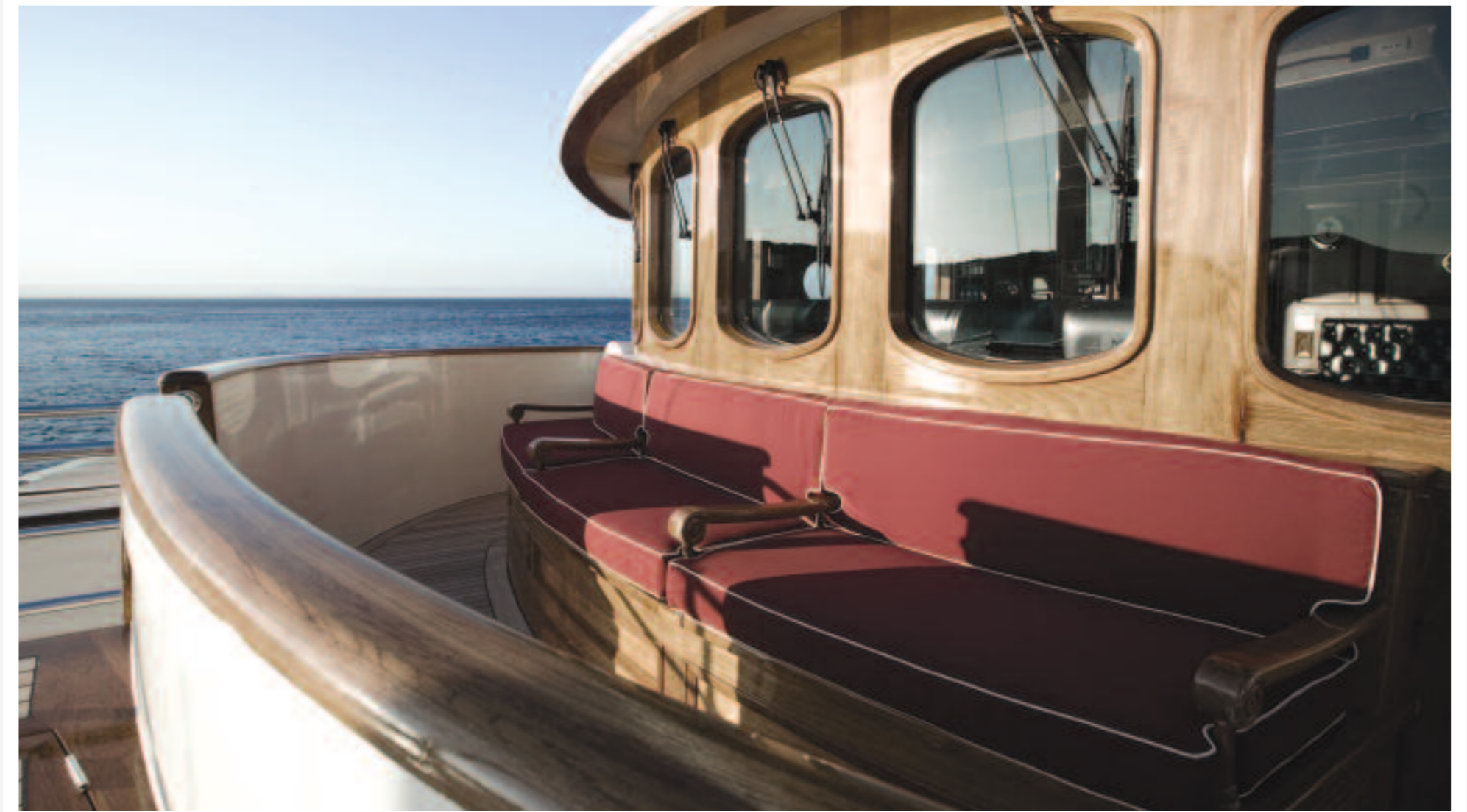
The Pilot House, forward on the Upper Deck.