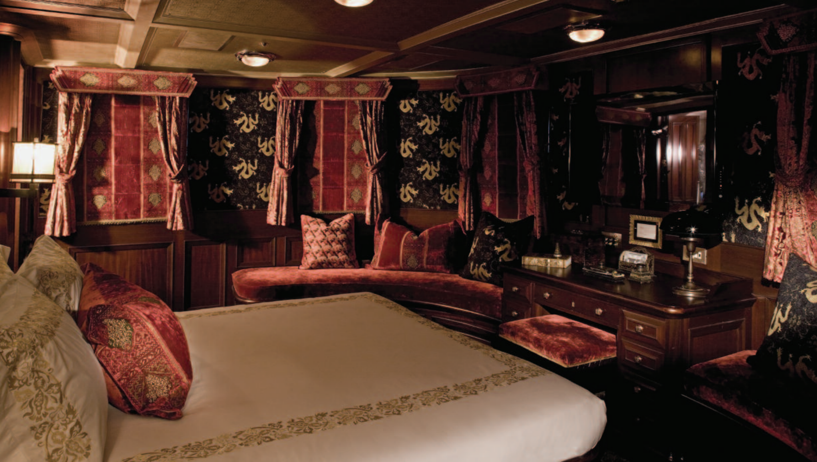
The Master Stateroom.