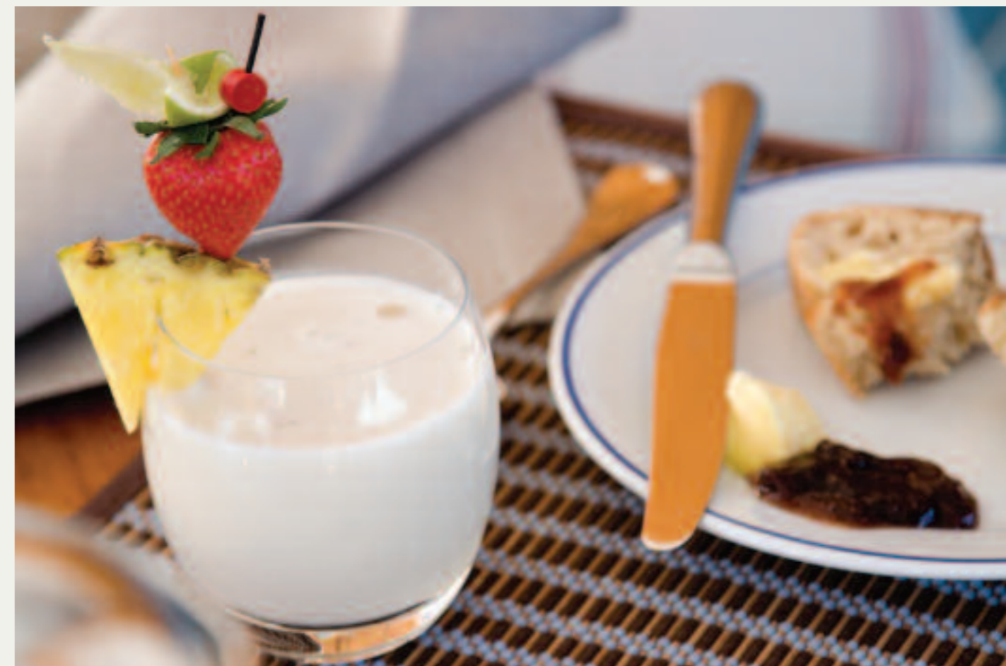
Breakfast on the Upper Deck.