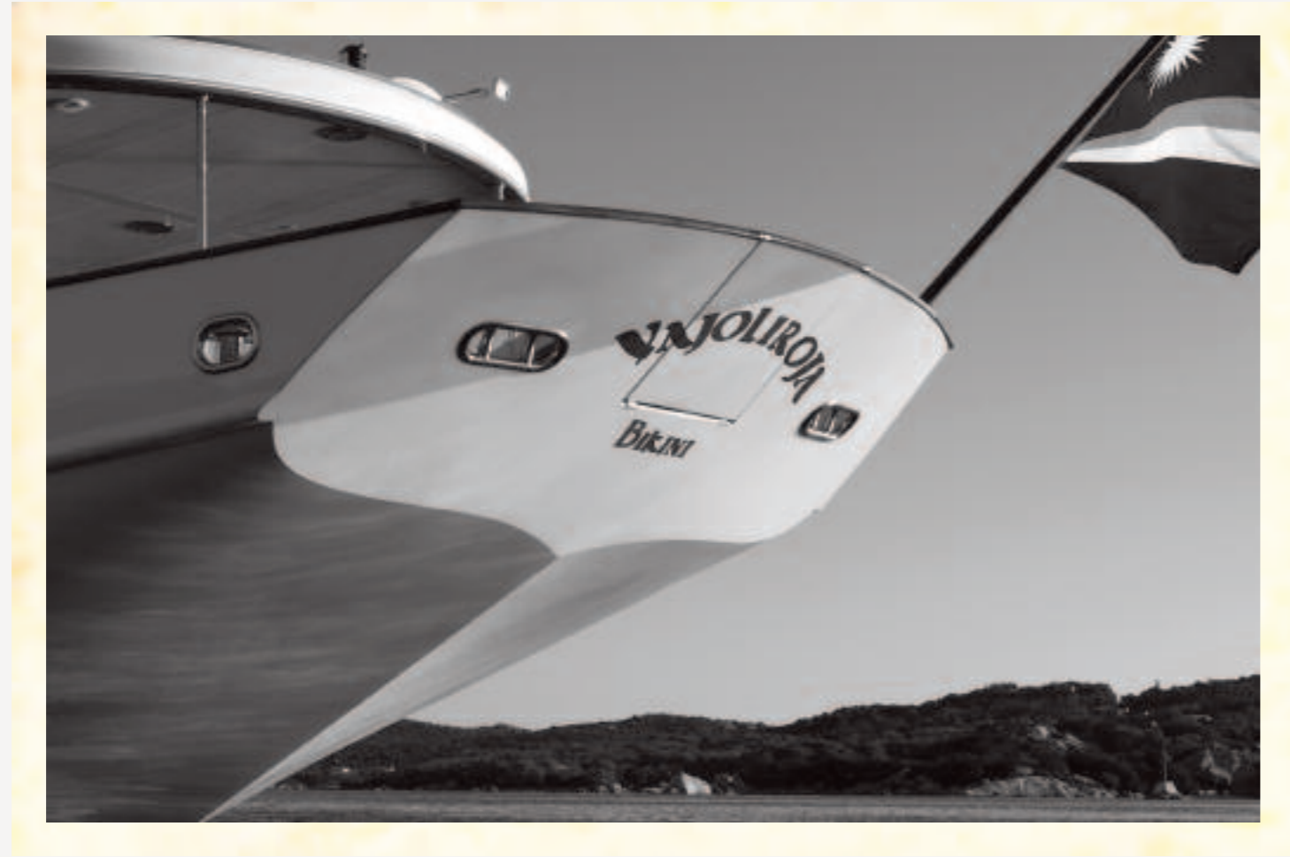
The distinctive counter stern.