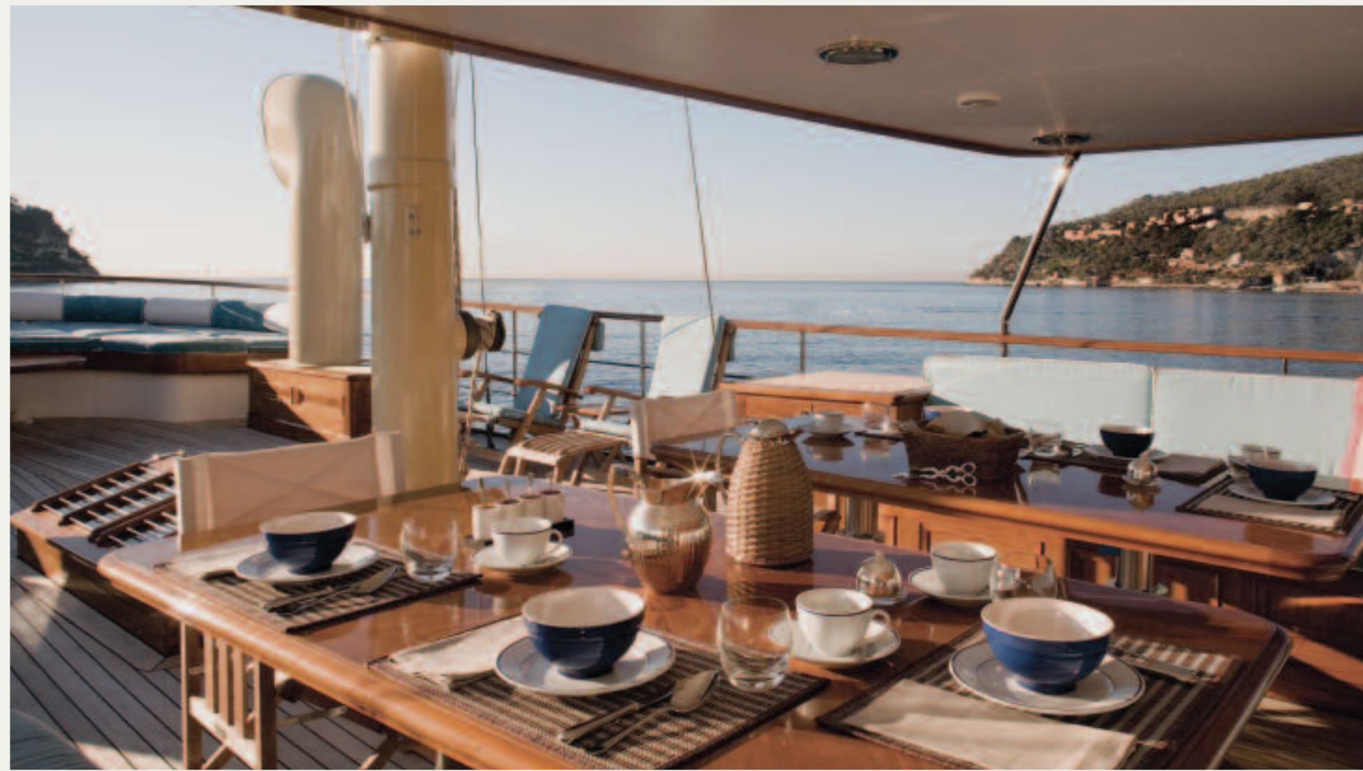
Make up to a different view every day.