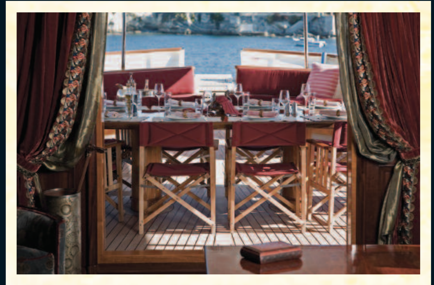
Luncheon at anchor, Villefranche, French Riviera.

T HE MAIN DECK houses the Master Stateroom, the Main Saloon, with dining area and cinema, and a magnificent aft deck. The oval table here seats 10 for alfresco dining. Coffee tables sit behind on either side and half-moon seating hugs the stern. Double doors lead into the main saloon where you can sink into velvet sofas and watch a movie on demand or play one of the many vintage games. Specially commissioned Art Deco furniture, rich feather & fur trimmed window dressings, unique objet d'art and collectors books create a theatrical, bohemian atmosphere.