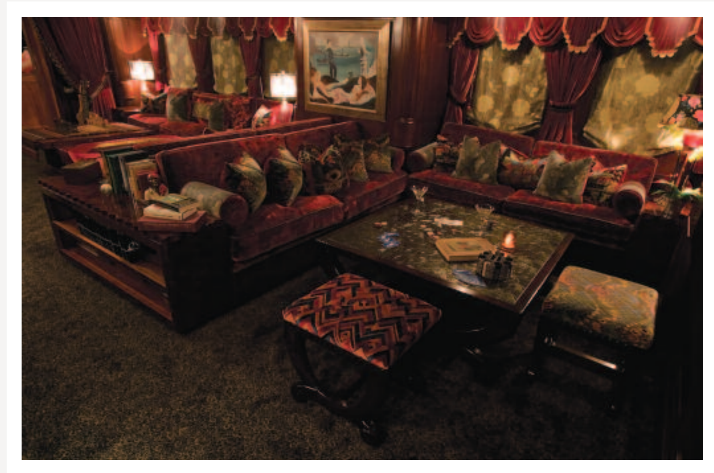
Dining and relaxing in the Main Saloon.