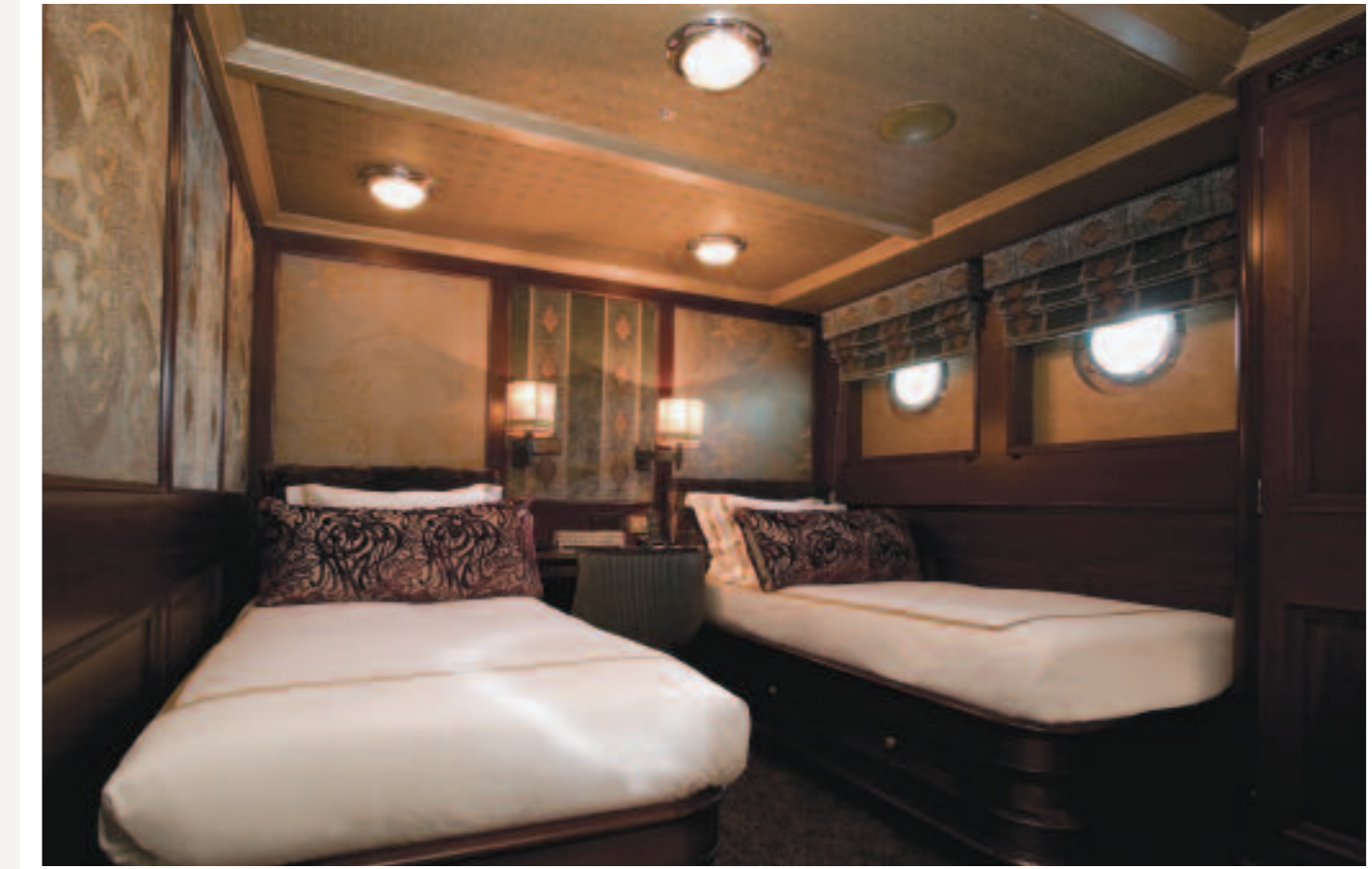
En suite guest accommodation on the Lower Deck.