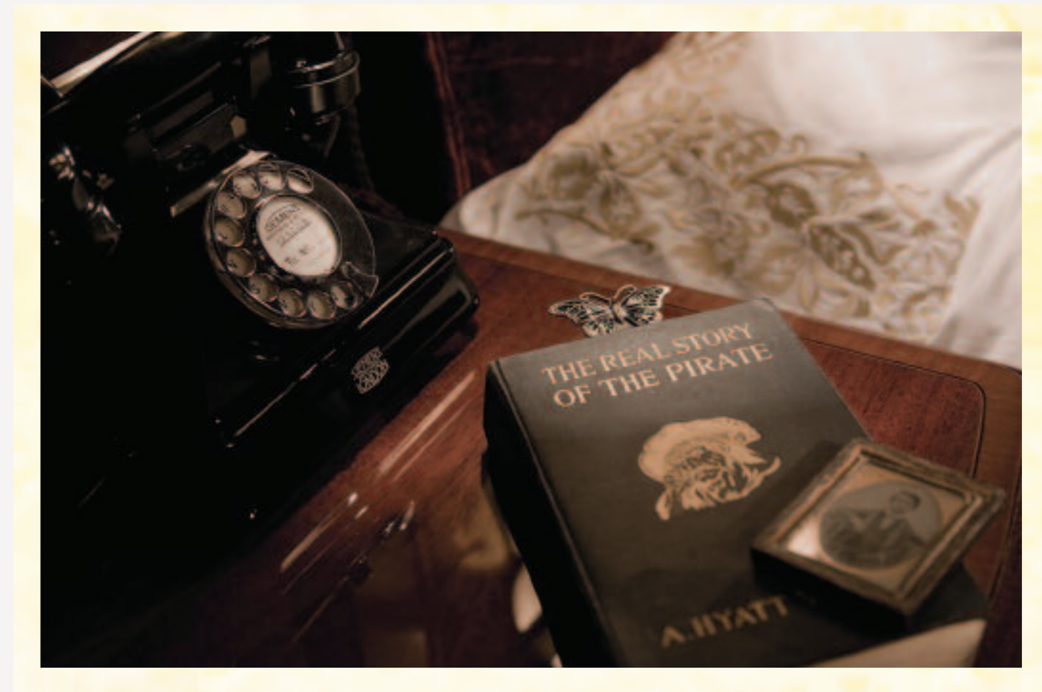
Details from the Master Stateroom