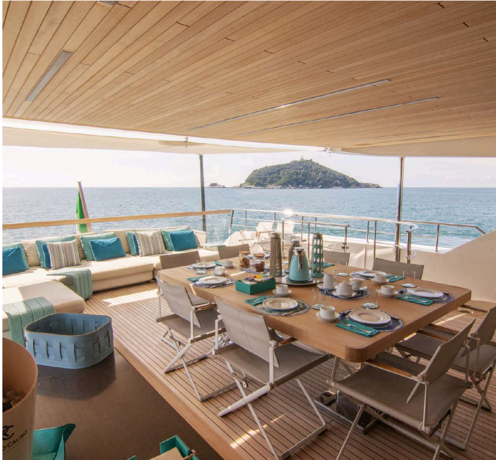
Dining table for 11 | Comfortable sofa and lounge area | Smooth flow with the main salon