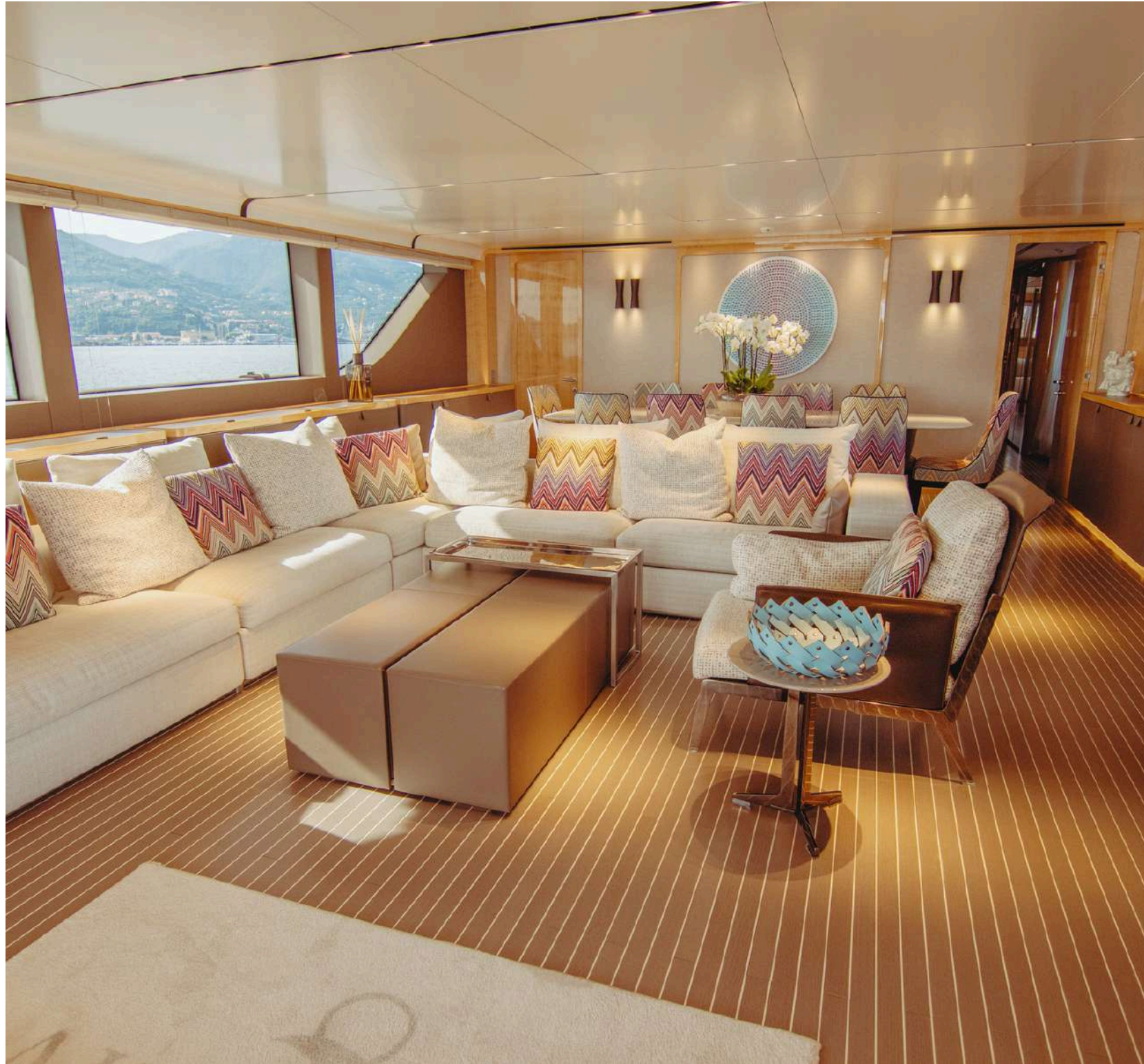
Lounge and dining area | Contemporary design by Citterio Viel | Warm, inviting ambience | Direct access to the aft deck