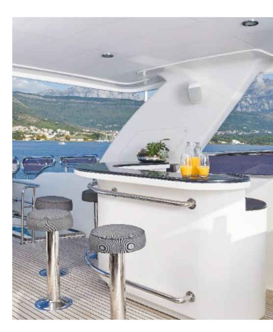
Hard roof offering additional shade Helm station with seating for 4-5 people