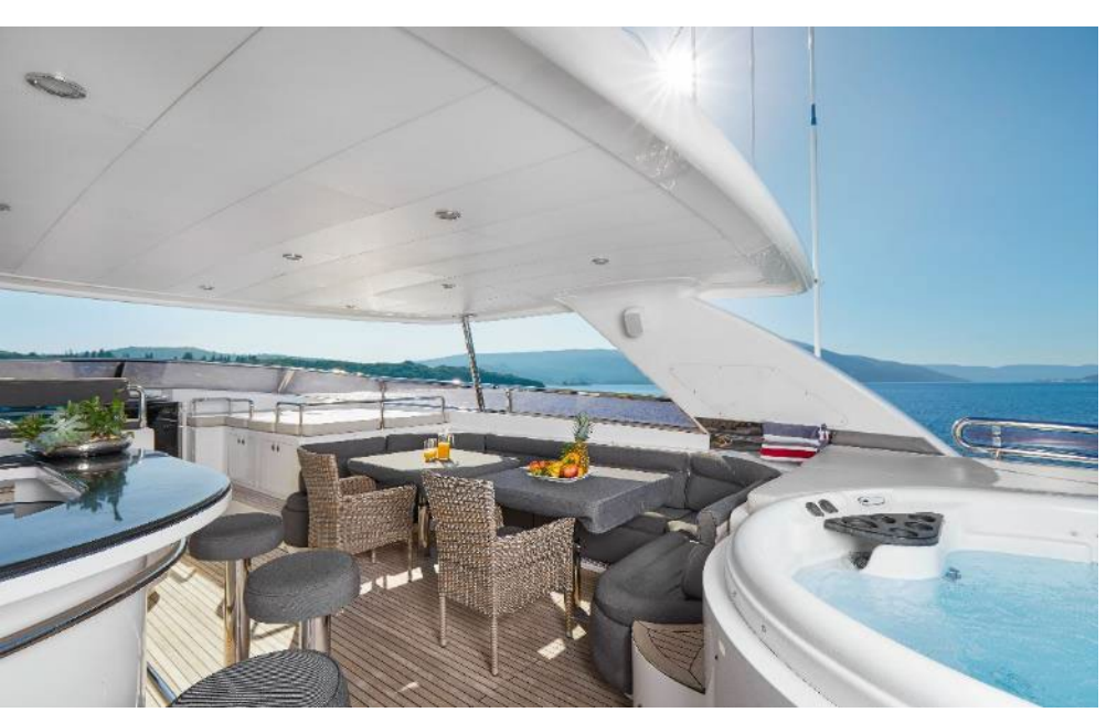
Horizon 97 yacht with on deck jacuzzi